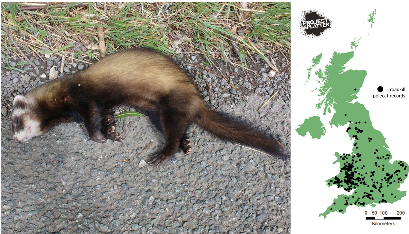
Fig. 3 Roadkill polecat. Physical characteristics of such casualties can be used to determine levels of hybridisation between polecats and feral ferrets, as well as to record their geographical distributions. Inset map

shows distribution of polecat roadkill records in the UK as collated by wildlife-vehicle collision citizen science project 'Project Splatter'