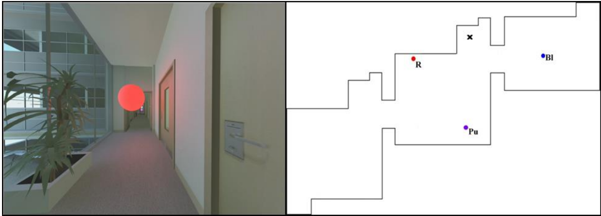
Figure 1. Left panel, screen capture of virtual environment. Right panel, example of possible layout of landmarks on route.