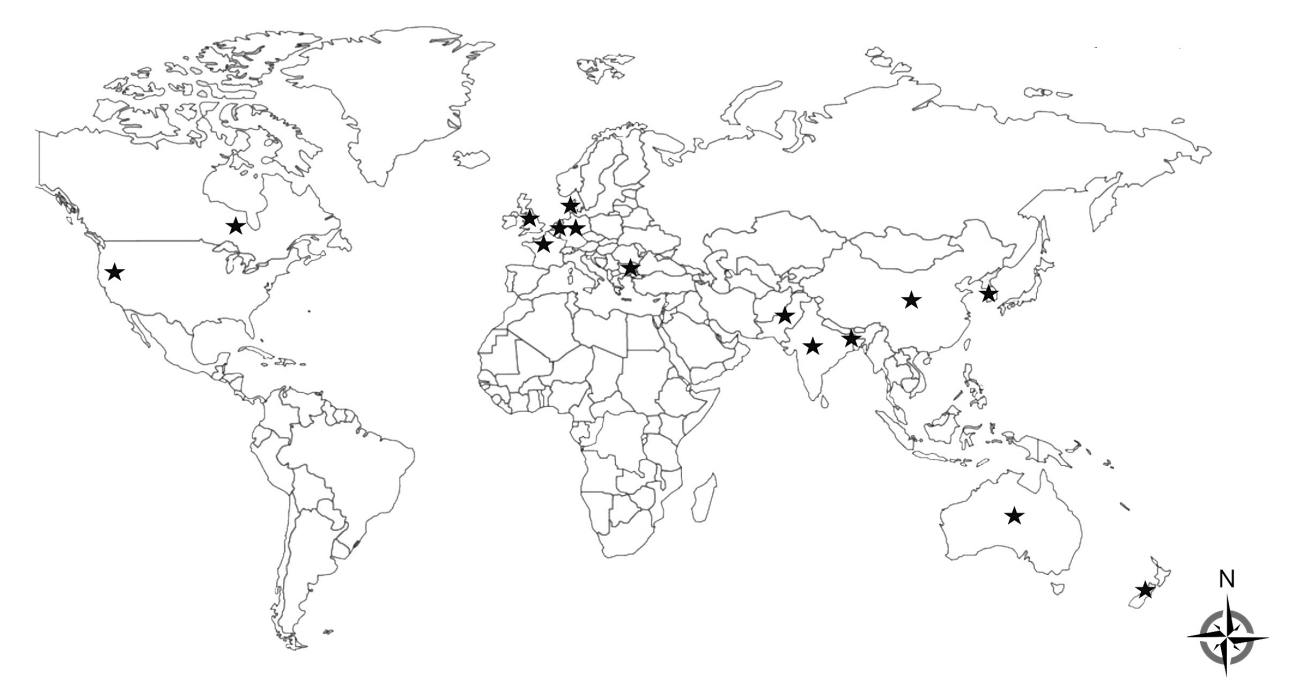
Figure 2. Sites where New-Delhi metallo-β-lactamase variant 1 (NDM-1)–encoding Escherichia coli sequence type (ST) 101 isolates have been detected worldwide. Stars indicate countries where NDM-encoding E. coli ST101 has been detected: Australia, Bangladesh, Belgium, Bulgaria, China, Canada, Denmark, France, Germany, India, Korea, New Zealand, Pakistan, the United Kingdom, and the United States.

Because E. coli is the leading cause of human urinary tract infections, bloodstream infections, and neonatal meningitis, the ability of NDM-1 to give this bacterium clinical resistance to carbapenems is of concern ( 14 ). E. coli is also universally carried in the human gut. Therefore, we focused on this species because it is likely to be the greatest threat to human health. E. coli encoding NDM-1 were found in 3 of the 7 sampled regions, and genotyping showed they belonged to only 3 STs: ST648, ST101, and ST405. These same 3 E. coli genotypes are