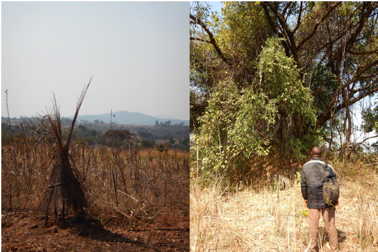
Figure 3: Left – example of a chief’s burial site, with a small grass ‘hut’; Right – a sacred natural site, including a large old tree plants over a chief’s burial site. The ‘hut’ is directly below the main tree trunk.

“When the chief designs it, this area is for special purposes like rituals... If the chief says that you are not allowed to cut trees in that area... then if you disobey and go and cut a tree and then the chief finds you... sometimes you might meet with a very big snake there” Village Chairperson, Namwanga, age 50-59.