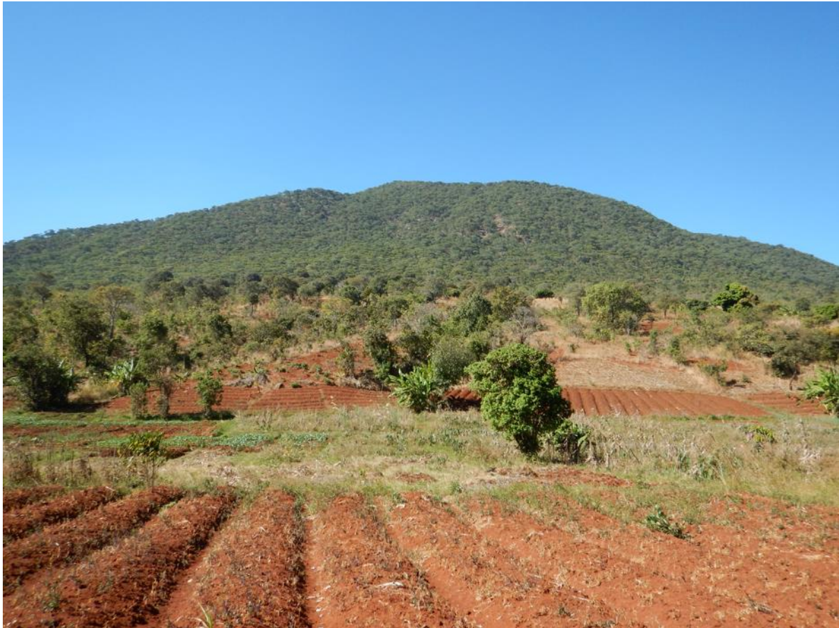
Figure 2: Sacred forest, Malonji Village. This was one of the most extensive sacred natural sites across all six villages, with numerous ritual sites within the forest.

These six villages conformed to the typical political situation across rural Mbozi. Each village is dominated by the Nyiha tribe governed by local chiefs ( abamwene ) who are assisted by councillors ( awahombe ), elders ( abhasongo bha mumsi ), and kinsmen ( wanamfumu ). During the pre-colonial and colonial period, these chiefs were the local government, with chieftainship passing down through a male lineage. The chieftainship system was abolished in 1961 shortly after Tanzania became independent, replaced by directly elected village councils. The abolition of chieftainship has reduced the official political role of Nyiha chiefs to spiritual leaders and overseers of sacred places. In these villages, chiefs and their assistants were still considered to have important powers over ancestral and nature spirits which inhabited local forests, alongside other roles in arbitrating disputes and providing traditional medicine. The powers of the chief are closely entangled with sacred site protection. Chiefs control access to sacred forests, giving permission to enter through speaking directly to ancestors, and administering fines and sanctions against those who do so without permission. One chief in Ilembo described these roles: