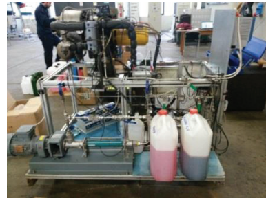
Fig. 2. Garrett GTP 30-67 at RE-CORD facility (Scarperia, Florence, Italy).