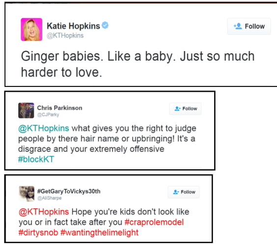
Figure 1. Opening tweet and two responses

In our analysis we were interested in 1) how users on Twitter construct posts that are treated by others as hateful and 2) how users construct responses to an opening post to perform interactional actions such as expressing agreement or disagreement with it. To give a brief example, Figure 1 shows an opening post tweeted by Katie Hopkins – a public figure in the UK well-known for the expression of inflammatory opinions<sup>2</sup>, often targeted towards certain groups of people– and two responses that followed it<sup>3</sup>.