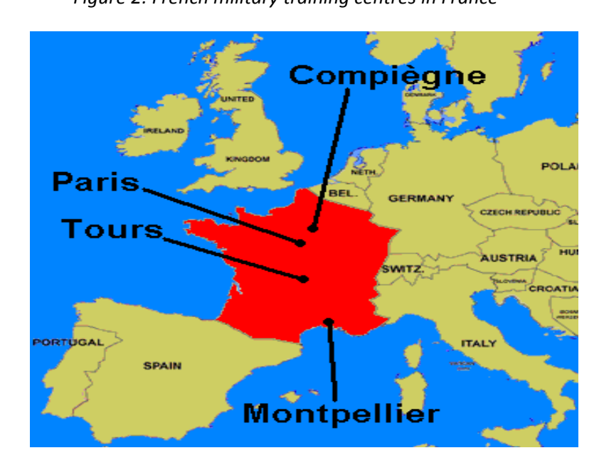
Figure 2: French military training centres in France

The department of peace-keeping operations and the defence and military division within the French ministry of foreign affairs collaborate with the UN department of peace-keeping operations in taking charge of individual peace-keeping training (see Figure 7). In relation to this, the French authorities deliver individual training in Africa at the training centre in Koulikouro, Mali, and in France at Paris, Compiègne, Montpellier and Tours (see Figure 6). RECAMP involves close links with the UK's African Peace-keeping Training Support Programme, which is itself subsumed within the conflict prevention pool (CPP) in 2001 and the United States via its training programme (ACRI or African Crisis Response Initiative), not to mention with the African Union.