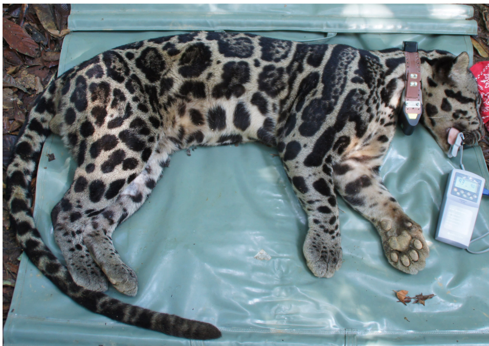
Fig. 1. Free-ranging Sunda clouded leopard ( Neofelis diardi ) anesthetized and fitted with a GPS-collar.

femoral pulse and/or a pulse-oximeter. We used a digital thermometer to measure rectal temperature. We recorded all parameters every ten min. Muscular relaxation was subjectively measured by the control of the muscular tone in one of the hind limbs [5]. We evaluated the pain perception by withdrawal reflex during venipuncture [24]. Capillary refill time was evaluated for each individual. Any lesions on the body or teeth fractures found during the medical exam were recorded. Study animals were weighed, and their body condition assessed according to the following criteria: 1/5 was defined as cachexia, 2/5 as underweight, 3/5 as ideal, 4/5 as overweight and 5/5 as obese. Standard body measures were taken, hair was collected for genetic studies, blood samples, feces and urine were collected whenever possible for disease studies, and a medical exam was performed on each individual. All free-ranging clouded leopards were fit with a GPS-collar (Fig. 1), with the exception of one female, whose weight and overall body condition precluded attachment. Upon completion of the medical exam and/or GPS-collar fitting, individuals were returned to the cages and atipamezole administered as relevant. Animals were released only after they demonstrated the ability to stand with no wobbling.