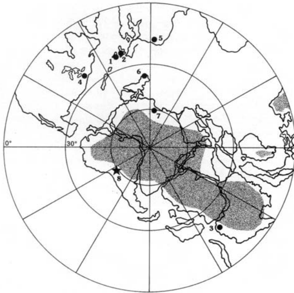
Figure 3. Distribution of plant megafossil assemblages in the late Silurian southern hemisphere. Land areas stippled. 1: Wenlock, Ireland; 2: Ludlow-Přídolí, southern Britain; 3: Ludlow, Australia; 4: Přídolí, New York State; 5: Přídolí, Podolia; 6: Přídolí, Bohemia; 7: Přídolí, Libya; 8: Tarija. Localities in Greenland, Siberia, Kazakhstan and Xinjiang are in the Silurian northern hemisphere. Locality details in Edwards (1990b); continental positions based on Denham & Scotese (1987).

high throughout the year (Parrish, 1990). The sediments of the Kirusillas Formation offer little information on palaeoclimate, unlike the diamictites of the Cancañiri (Zapla) Formation. Originally interpreted as true marine tillites (Rodrigo, Castaños & Carrasco, 1977) these are now considered turbidites (Bossi & Viramonte, 1975), although continental mountain glaciers may well have contributed significantly to the sources of sediment (Hambrey, 1985). However, the faunas at the base of the Kirusillas Formation (Upper Llandovery), preserved in a progradational delta system, are typical of Malvinokaffric assemblages. The siltstones and sandstones derive from an early Palaeozoic land mass to the west, presumably the sites of the growth of the plants (Andreis et al. 1982; Böttcher et al. 1984). The excellent preservation of the specimen described here suggests minimal transport.