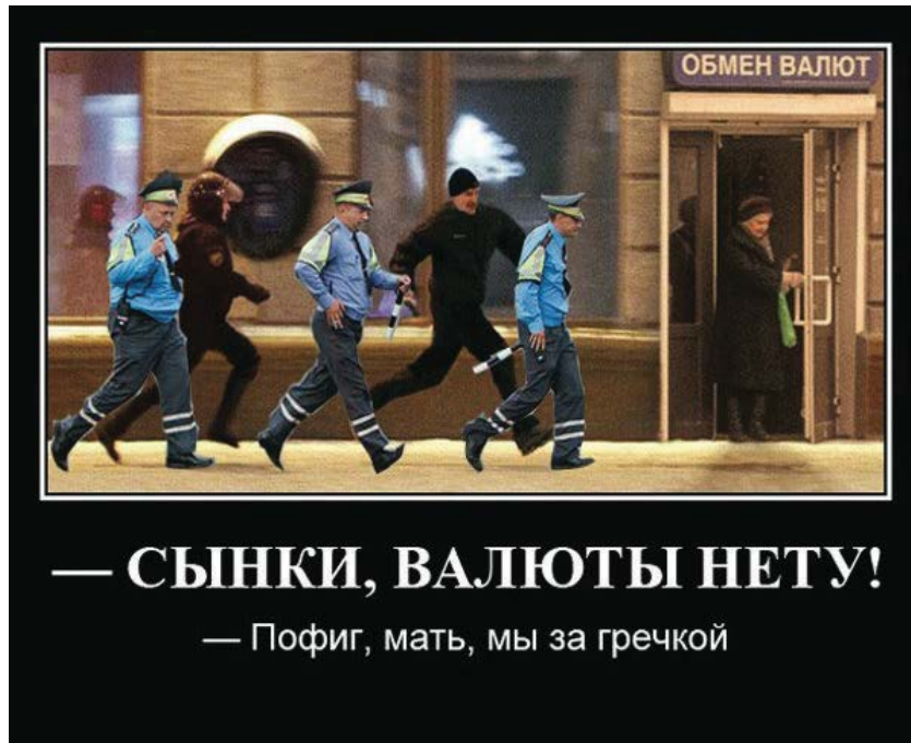
Figure 4 An example of the internet meme that plays on shortages of foreign currency and deficit of buckwheat in 2011 in Belarus. http://kyky.org/life/istoriya-belorusskoy-valyutnoy-fotozhaby