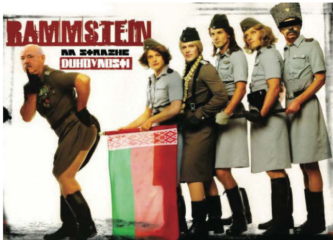
Figure 3 An example of the internet meme that uses a Rammstein album cover. Posted on Lipkovich’s blog, 2011 ( http://lipkovichea.livejournal.com/ )

Nevertheless, subversive tactics online can be employed by various actors. Similar to the Crimean incident, also in Belarus, Internet memes have become one of the wider spread non-hegemonic tactics due to the ease and relative safety of their production and dissemination. The circulation of these online grassroots satirical images explicates the difficulties involved in controlling information flows online. This is partially due to the impossibility of exerting control over “multiple” readings of the satirical messages. Three examples below contextualize challenges to authoritarian governments seeking to maintain control over media output and reception.