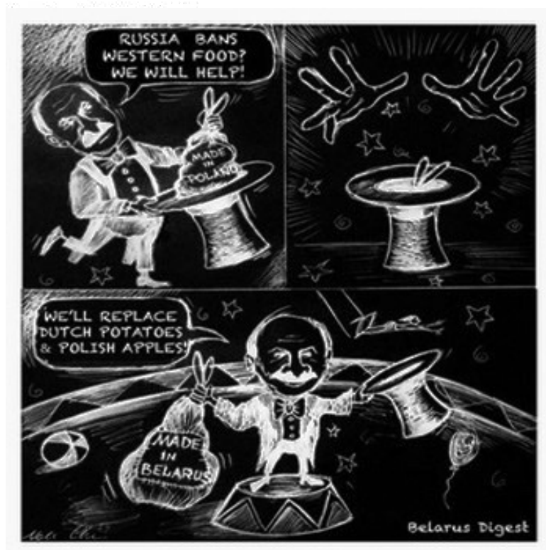
Figure 5 An ironical illustration of how Belarus supports Russia after the Russian food embargo of certain western foods.

BelarusDigest, 2014 ( http://belarusdigest.com/cartoon/ cartoon-russia-bans-western-food-we-will-help-18879 )