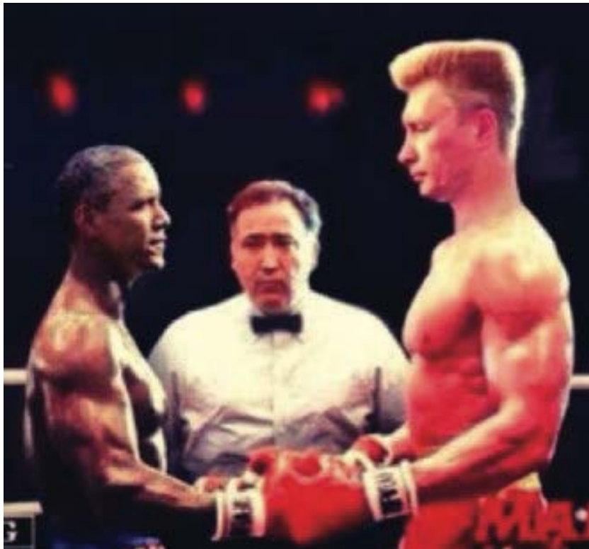
Figure 1 An example of the Internet meme that compares Vladimir Putin and Barack Obama to the characters of Rocky IV (1985).

Curiously, during the 2011-12 anti-government protests in Russia, many memes from the Facebook resistant groups, transferred to the offline posters of the activists in Moscow and St Petersburg. This example shows that, when