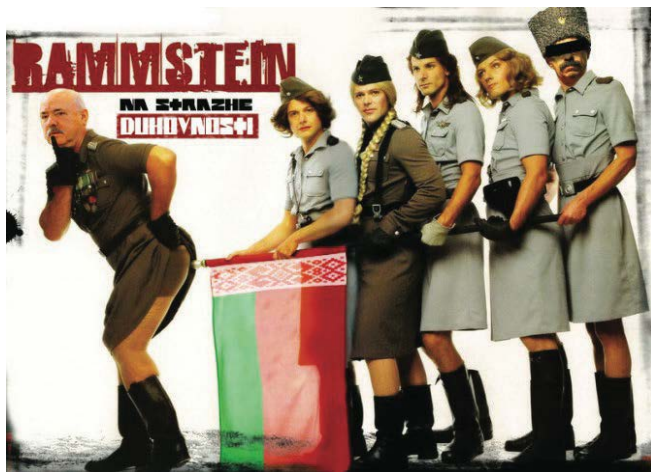
Figure 3 An example of the internet meme that uses a Rammstein album cover. Posted on Lipkovich’s blog, 2011 ( http://lipkovichea.livejournal.com/ )

Nevertheless, subversive tactics online can be employed by various actors. Similar to the Crimean incident, also in Belarus, Internet memes have become one of the wider spread non-hegemonic tactics due to the ease and relative safety of their production and dissemination. The circulation of these online grassroots satirical images explicates the difficulties involved in controlling information flows online. This is partially due to the impossibility of exerting control over “multiple” readings of the satirical messages. Three examples below contextualize challenges to authoritarian governments seeking to maintain control over media output and reception.