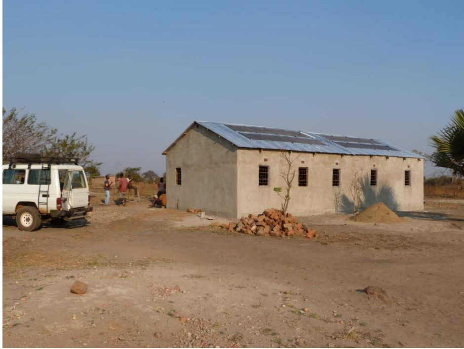
Figure 2 - The installed solar panels