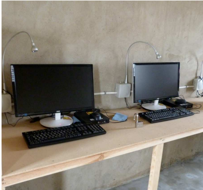
Figure 5 - Installed Computers