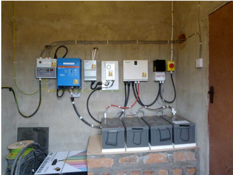
Figure 3 - Switchroom equipment. Wall mounted equipment from left to right; 230V-AC distribution board (wylex), 3kVA Inverter, 12V-DC distribution board, 48V-DC:12V-DC converter, 48V-DC distribution board (schneider), Maximum power point tracker (Morningstar), solar panel isolator.

An important aspect of the project was the power supply link to the adjacent admin block. To achieve this, a trench was dug and an armoured (3 core 6mm 2 ) cable laid. Within the admin block a distribution board was provided to allow the future wiring of small power and lighting. At each end of