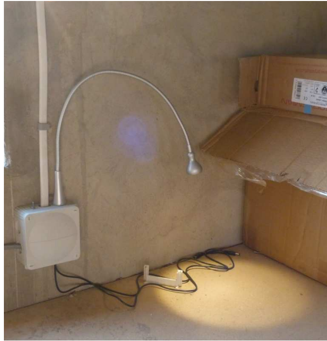
Figure 4 - 12V DC Distribution Box

The Morningstar MPPT was supplied with a remote monitoring kit. The kit monitors the battery and solar panel voltages and the system temperature. It is able to ascertain the system state (i.e. daytime generating or night time standby). It also reports the daily kWh supplied from the solar equipment. The remote monitoring interface was mounted within the solar classroom.