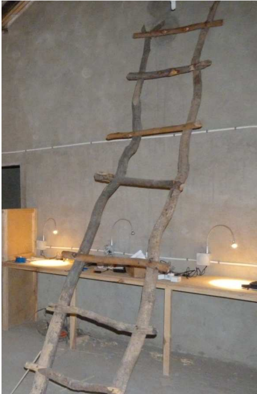
Figure 6 - The ladder used on site. An Aluminium (or similar) ladder may have increased the speed of installation

One challenge that was faced was how to involve the local workforce as much as possible in the electrical installation whilst making sure that work of sufficient quality was achieved. The workforce was very proficient at building tasks. For instance, a plinth for the batteries was built within a two hours of request. However, they were less familiar with electrical installation techniques. The more that locals can be involved, the better the understanding gained and the higher the sense of ownership afterwards.