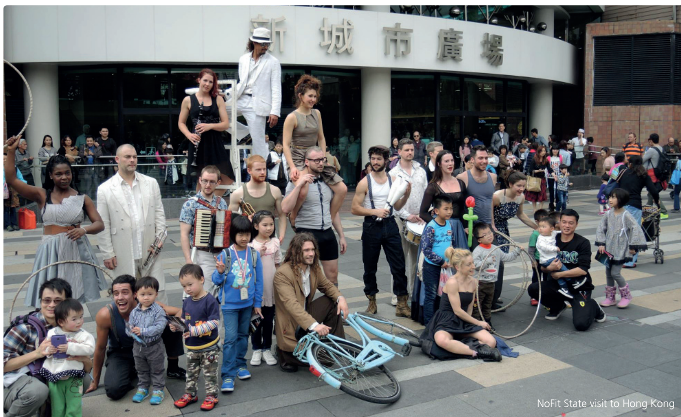
NoFit State visit to Hong Kong

For the Action plan to be effective, partnership working between the government, key agencies, higher education, cultural practitioners and stakeholders needs to be further developed. The Welsh Government's Cultural MoU Steering Group needs to be used effectively to identify lead organisations and supporting roles of others as well as the resource base.