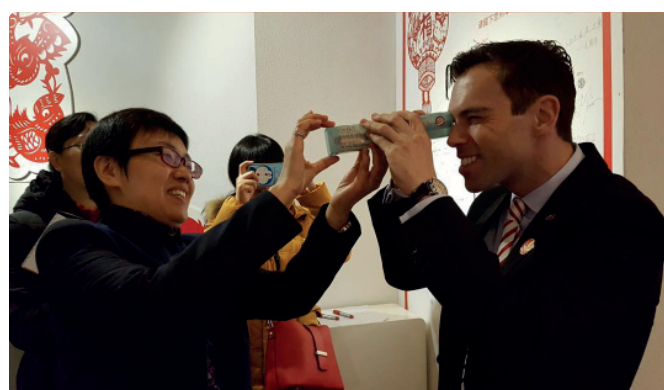
Top: Welsh Government's trade and culture mission, Shanghai, February 2017 lead by Cabinet Secretary for the Economy and Culture, Ken Skates