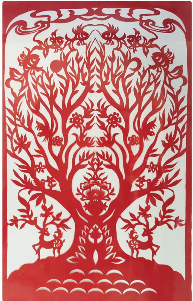
Part of a community art exhibition, Mass Art Centre, Xuhui District, Shanghai

It is recommended that frequent governmental level support for cultural exchange is required, such as through art exhibitions, theatre performances and participation in festivals. Regular media exposure of such cultural activities are crucial to raise the Wales-China diplomatic profile. Only when the Welsh Government has built a trusted diplomatic relationship with Chinese Regional governments, will the Chinese regional markets open to Wales allowing trade and business opportunities to flourish.