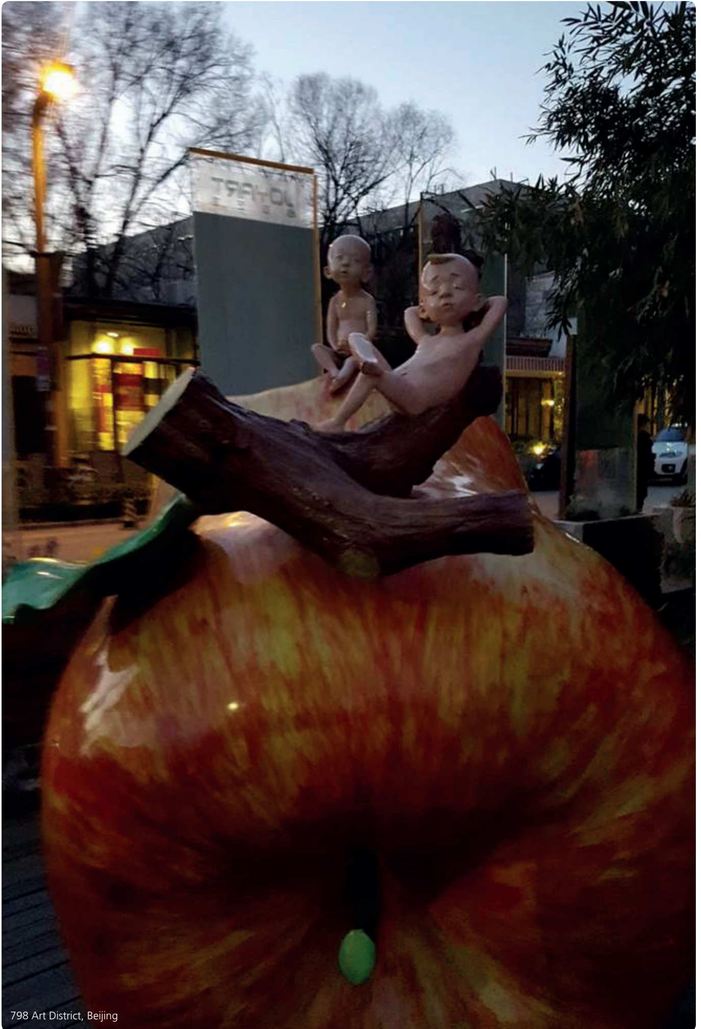
798 Art District, Beijing