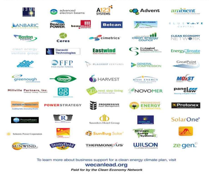
Figure 3: Advertisement in the Boston Globe by Massachusetts Clean Economy Network, 2010.

Massachusetts businesses are ready to lead if Washington will act.