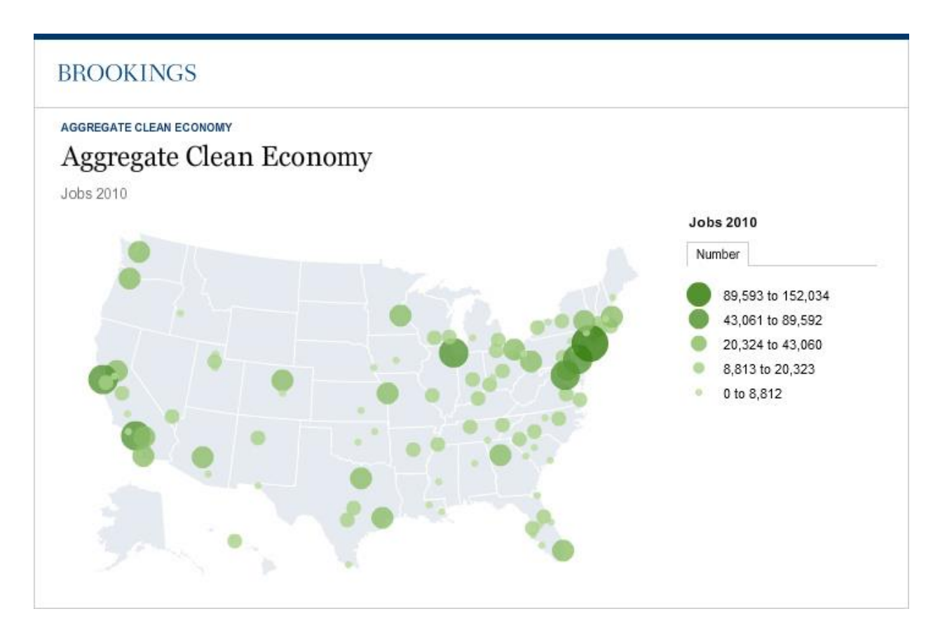
Figure 1. Aggregate Clean Economy by Metropolitan Area by Job Numbers.