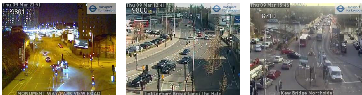
Figure 1. Example Images: uncongested (left), borderline (middle) and congested (right)

It is worth noting that the task of detecting of traffic congestion could be considered a ‘solved problem’ in the sense that companies such as Google offer live traffic prediction available via their map-related services. However, we are approaching this task purely as a means to explore CSU and, as the data sources mentioned above (and others we have used) come from multiple organisations and offer data in various modalities, we can clearly see that detecting traffic congestion this way simulates the context of operating within a coalition. Furthermore, as we ensured that the system architecture we developed remained decoupled from the specific problem, our final system can be used as a template for approaching other CSU problems by simply exchanging the data sources and services related to the congestion space to ones relevant to alternative CSU problems.