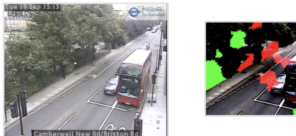
Figure 4. Original input image (left) and saliency map (right: red regions show evidence towards ‘congested’, green regions show evidence towards ‘not congested’)

Finally, to allow for the system’s final decision to be as interpretable as possible, the output of interpretable services can help provide explanations in combination with the output from services which are harder to generate an explanation for. As an example, the system can take advantage of the higher accuracy of the LSTM speed prediction model (outlined in Section 5) and in cases where the regression tree service (outlined in the same section) agrees with the LSTM, it can help provide explanation for the outcome. This relationship is also seen between the CNN congestion detection service (Section 4.1) and the more interpretable congestion reasoner service chain (Section 4.2).