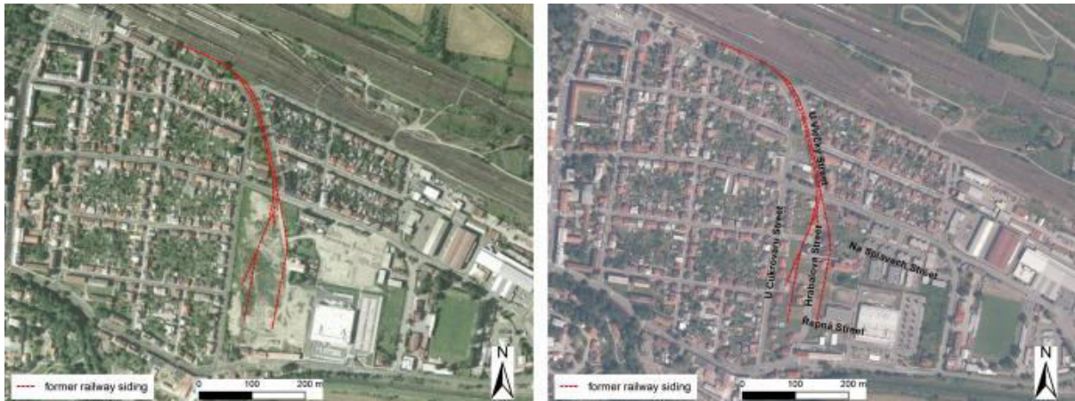
Fig. 4. The area of former sugar beet factory in Nymburk on the aerial picture from 2003 (left) and 2012 (right).