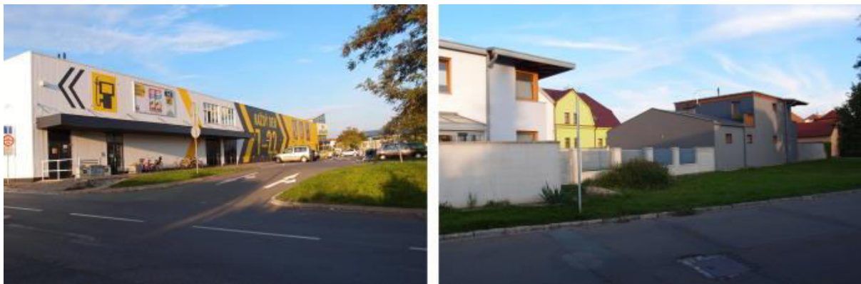
Fig. 5. The supermarket and family houses in the area of former sugar beet factory in Nymburk.