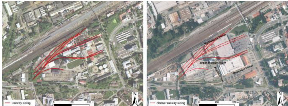
Fig. 3. The area of former sugar beet factory in Hodonín in an aerial picture from 1999 (left) and 2012 (right).

adapted as well (see Fig. 3). During the construction of the shopping mall, three new streets within the area of the former sugar beet factory were constructed, Krátká Street, Obchodní Street, and the already mentioned Redlichova Street. Completely new functions of the area appeared, complementing the existing urban organism of Hodonín. From the point of view of brownfield regeneration, this can be called a successful regeneration. The crucial factor underlying its success and attractiveness to investors might be found in its great location within the settled area of the city.