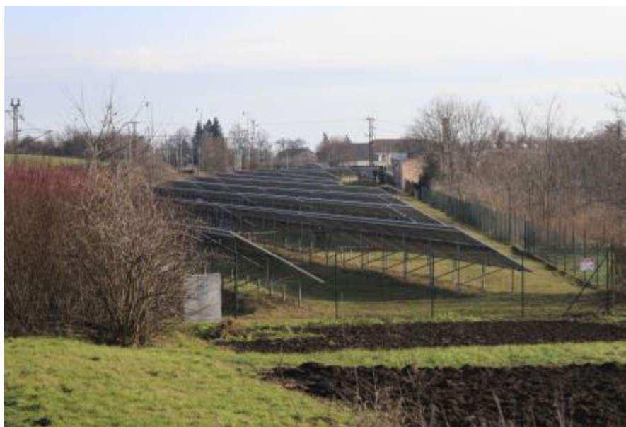
Fig. 7. The photovoltaic power plant located on the area of former railway siding of former sugar beet factory in Němčice nad Hanou.