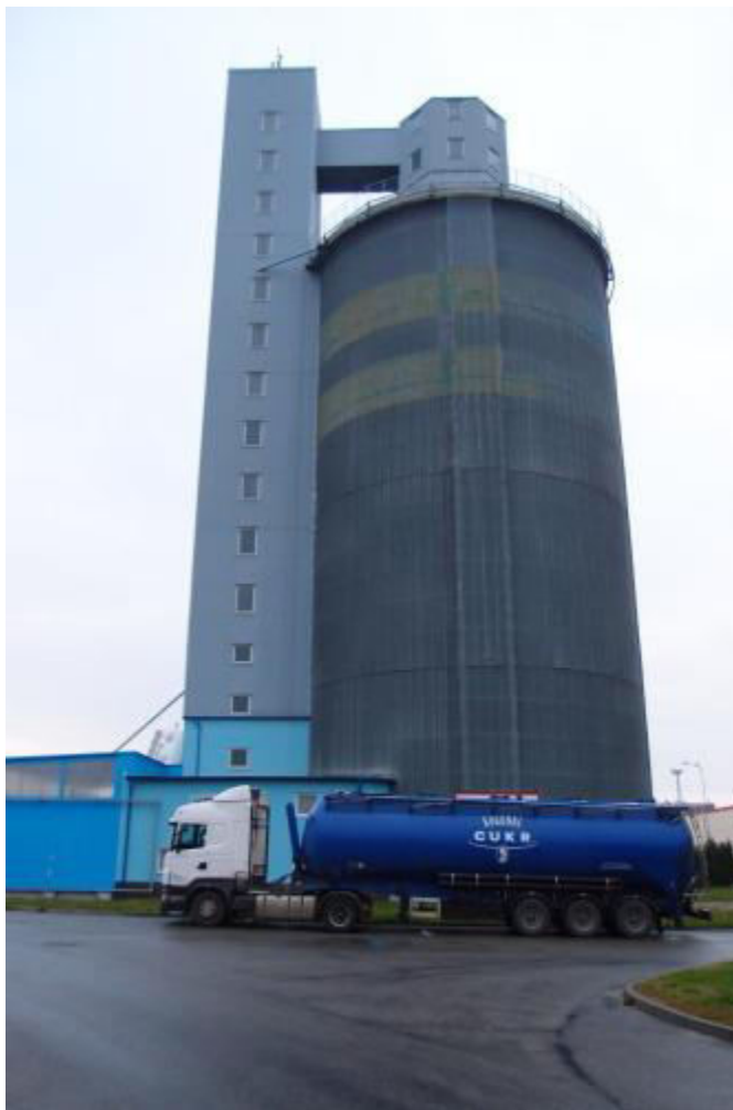
Fig. 2. The sugar storage tower of the former sugar beet factory in Hodonín. Current operation might be evidenced by the tank truck with sugar in the picture. Photo: M. Havlíček, 2014.

The area can be classified as type B according to the typology introduced above. Although a total transformation of the area has been effected, nonetheless the storage tower of the original factory has been preserved as a commemoration of the area's industrial history. After construction of the shopping mall, a minor local street was named after the founder of the factory, Adolf Redlich. The sugar storage tower (see Fig. 2) is still used by the sugar beet factory in Hrušovany nad Jevišovkou.