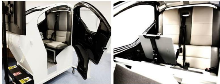
Fig 2. Exterior (left) and interior (right) of Lutz Pod simulator

Twelve journeys were filmed, mainly on public roads in and around Bristol (UK) city during the summer. Each route was planned using Google Maps and a route planner, and included a 2-minute pre-planned stop. Two journey types were recorded: short (7-minutes including stop) and long (12-minutes including stop). Four were selected (two short, two long) which gave a good representation of driving within inner and outer urban Bristol settings, with a mixture of road types, speed limits ranging from 20-40-mph, a blend of road infrastructure (e.g., traffic lights, crossings, roundabouts), and varied scenes (highly built-up to outer city suburbs with green spaces). An example journey was travelling from a railway station to home via a medical center.