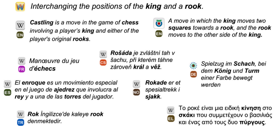
Fig. 1 Some of the definitions, drawn from different resources and languages, associated with the concept of castling in chess through our context enrichment procedure