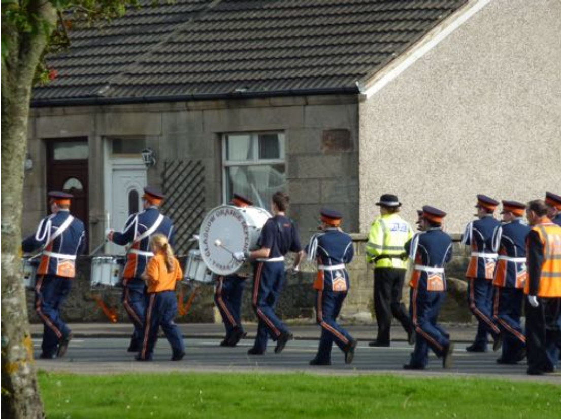
Image 4: An Orange Walk passes through a housing estate in Blantyre.

where the majority of the country's Catholics reside, there were approximately two hundred and fifty. 50 Audiences at an Orange Walk can vary from tens to thousands; when such parades march through the areas most populated by Scotland's Catholic community, which cannot participate in them and interpret them as offensive, Orange Walks and their most popular and iconic anthem, "The Sash," assume a provocative nature. Indeed, never has the old adage "it's not what you say—it's how you say it" seemed more apt.