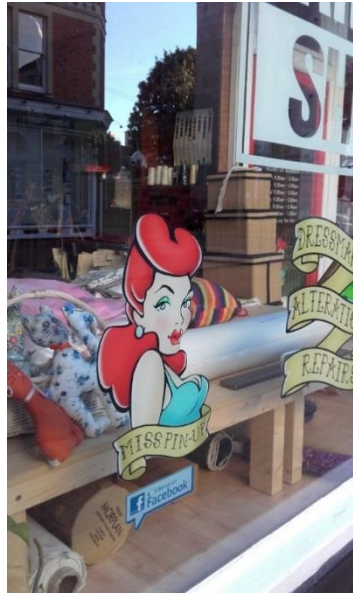
Figure 4: Familiarity triggers fascination