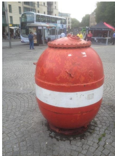
Figure 5: Historic elements are symbols of the identity of Bristol