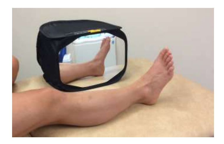
Fig. 1, shows the setup of the mirror box that was used to create the illusion of an intact and complete image of the missing limb. This is achieved by reflecting the unaffected limb.

The intervention consisted of one 10-minute session of MT with a mirror box (Reflex Pain Management Ltd, Cheshire, UK, Patent Pending), used to create an intact and complete image of the missing limb by reflecting the unaffected limb(Fig 1). The mirror was positioned perpendicular to the patient's midline and sock/shoes were removed. Participants were asked to move the unaffected limb while imagining and attempting to execute the movement with the amputated limb to match those seen in the mirror. The participant was asked to undertake movements for 10-minutes (e.g. flexion-extension cycles, rotation of the relevant body part and wiggling of toes) at their discretion,[9]and was in addition to conventional treatments. No attempt was made to control medication or record psychological therapy input.