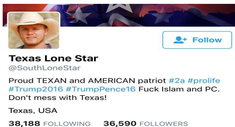
Figure 2: Screenshot of a spoofed profile