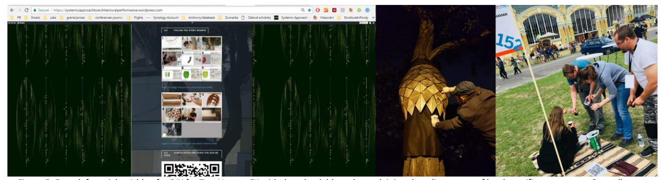
Figure 5: From left to right: A blog for DIY for TreeHugger CY with downloadable code, explaining the adjustments of local specific parameters; Our colleague from Collaborative Collective Ondřej Michálek, updating TreeHugger CZ with engraved QR code after public request noticed within the community and on social media, like Facebook; Maker Faire Prague 2018 Cross-Species Eco-Systemic Refreshments Station offering DIY seed bombs of honey producing species and QR code leading to the DIY recipe of 'fast food restaurant for birds and bats', the TreeHugger insect hotel.

or attached to our prototypes or just simply marked at different fairs events (see Figure 5) or published at professional web sites such as Rhino News (Davidová, 2018). Such way, the research by design is offering generative prototypes globally under the Non-Commercial Use and Modification Creative Commons Licence (Creative Commons, 2017) with the opportunity of local specific adaptation of the initial concept of the 'schools of thoughts' (Hensel, 2015).