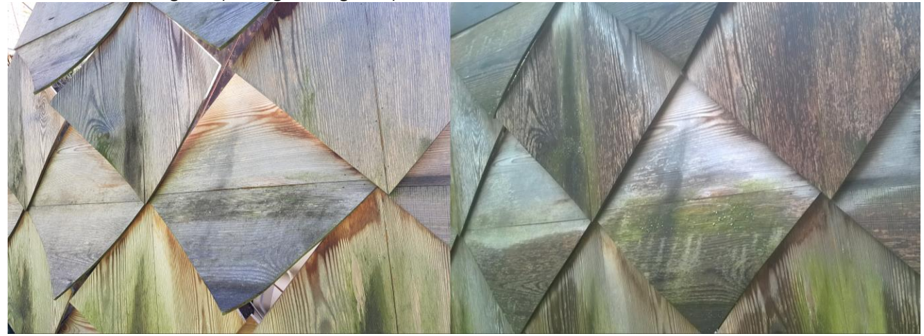
Figure 2: Responsive solid wood screen Ray 2 co-performing with relative humidity, algae moisture sorption and temperature. The responsive wood panelling is moderating micro-climate: either producing humid air flow through its warping and moisture evaporation in hot and dry weather or sorping and enclosing it in humid and cold situation. This is moderated by algae moisture sorption: larger warping when dry and hot, prevention of warping in opposite direction when it rains.

Interventionist co- and re-design takes on the generative and performative agenda of the full-scale prototype in real life environment across its eco-system. The prototypes give rise to cross-species opportunistic use of eco-systemic services, such as climate comfort (hygroscopicity of wood and air flow due to warping), clearing of air polution (the algae and the wood's clearing capacities in case of air flow), urban furniture (the pavilions serve for people and animals), habitation (algae, plants and insects), nutrients (sugar in wood and blossoming plants on or around some of the prototypes, insects as a food source for birds and bats), etc. The performance of such services is however co-designed through integration of interaction across both, living and non-living, biotic and abiotic, agents (see Figure 2Figure 4).