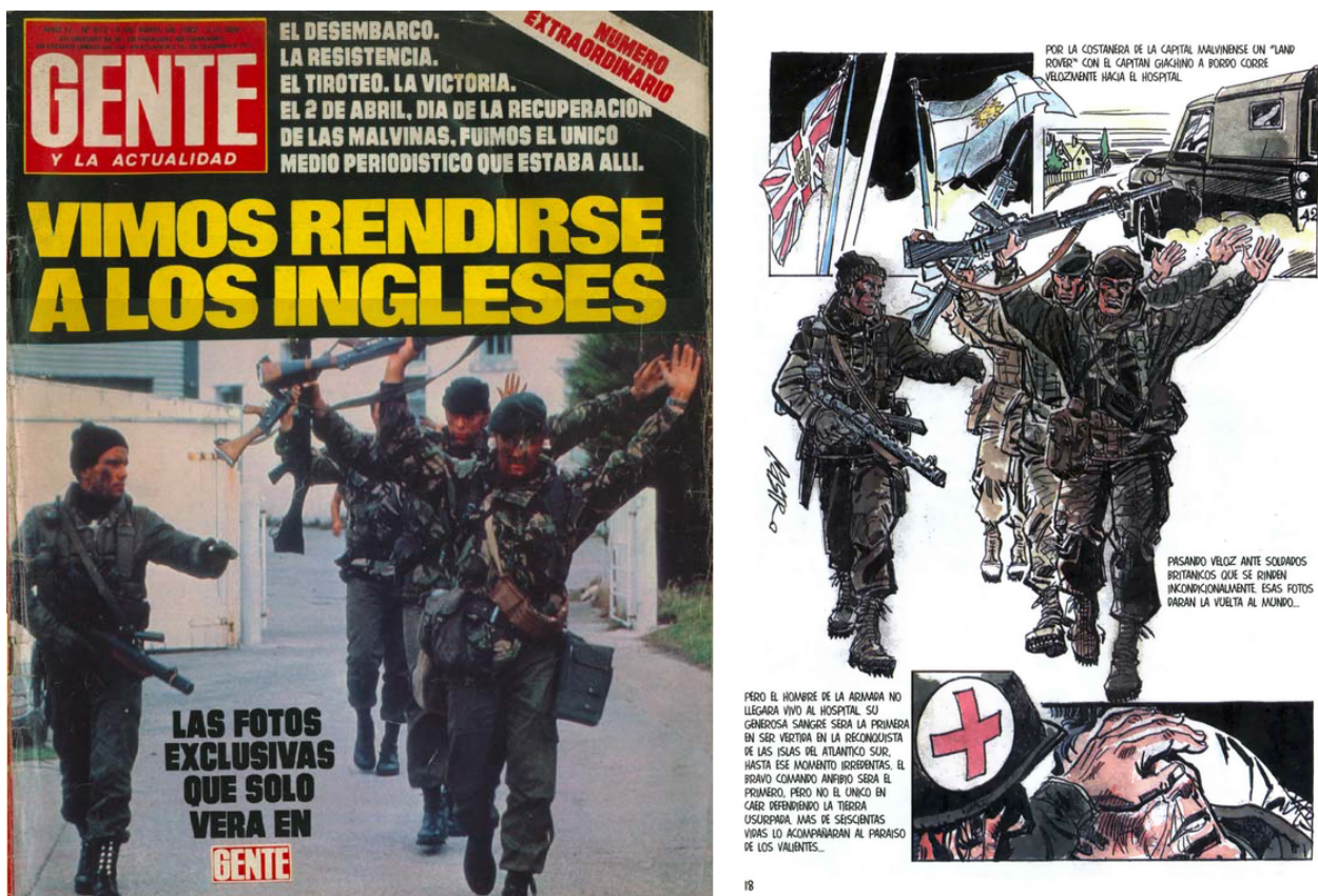
Fig 2: Left: cover of Argentine magazine Gente from April 8, 1982. Right: page from the first episode of La Armada en Malvinas (2007).

Although this ideological message is largely text driven, delegating the artwork to a supporting, illustrative role, several episodes contain panels that are direct renditions of photographs from the events concerned and that were circulated widely at the time. The first episode, “El desembarco argentino del 2 de abril de 1982” (The Argentine Landing on April 2, 1982), for example, includes a prominent drawing based on an iconic photograph that appeared on the cover of the popular Argentine magazine Gente on April 8, 1982. It shows an Argentine soldier waving his gun at three Royal Marines with their arms raised in surrender on April 2 of that same year (fig. 2). 3