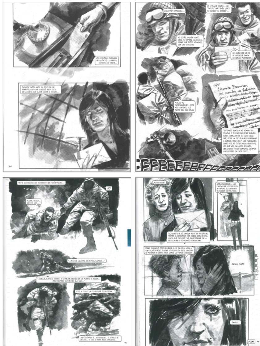
Fig. 6: Selected pages from “Carta a un soldado,” in Malvinas: Historias ilustradas (2012), depicting flashbacks of the female character.

protagonist, Silvina. The story starts with Silvina coming across a letter she wrote three decades earlier, but never sent, to a soldier named Ramiro, who was fighting in the Falklands War alongside her best friend Camila's fiancé (upper left page in fig. 6). The historical dimension of the main story is unpacked through her memories and the contents of the letters they exchanged (upper right and bottom left pages in fig. 6). The story ends by drawing the audience back to the present setting, where Silvina and Camila blame the cruelty of the British soldiers for Ramiro's death, praising his courage and heroism and vowing to never forget him.