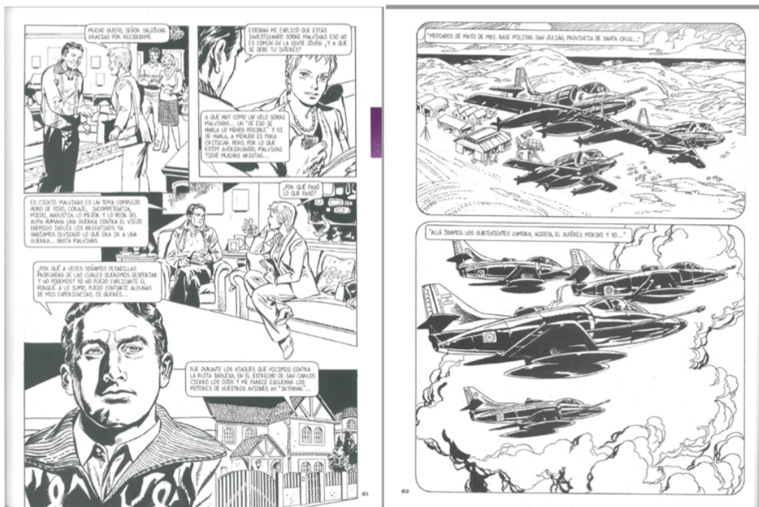
Fig. 7: Selected pages from “El juego de la guerra,” in Malvinas: Historias ilustradas (2012), depicting flashbacks of an Argentine veteran of the Falklands War (the character shown in the bottom panel in the left page).

As our analysis of several stories from the 2012 volume of Falklands War comics shows, as the war becomes more distant, the visual narrative uses more personalized, character-centered fictional strategies to immerse a new generation of readers in the historical events of the factual war, of which they have no direct recollection. While at this point in time, it would appear that remembering the Falklands War in Argentine culture remains the prerogative of those directly affected by it, it is only a matter of time before the readers of this “postgeneration” (Hirsch 103 et passim) will themselves begin to engage in transmitting their parents’ “traumatic knowledge and experience” (106), to which these comics bear witness.