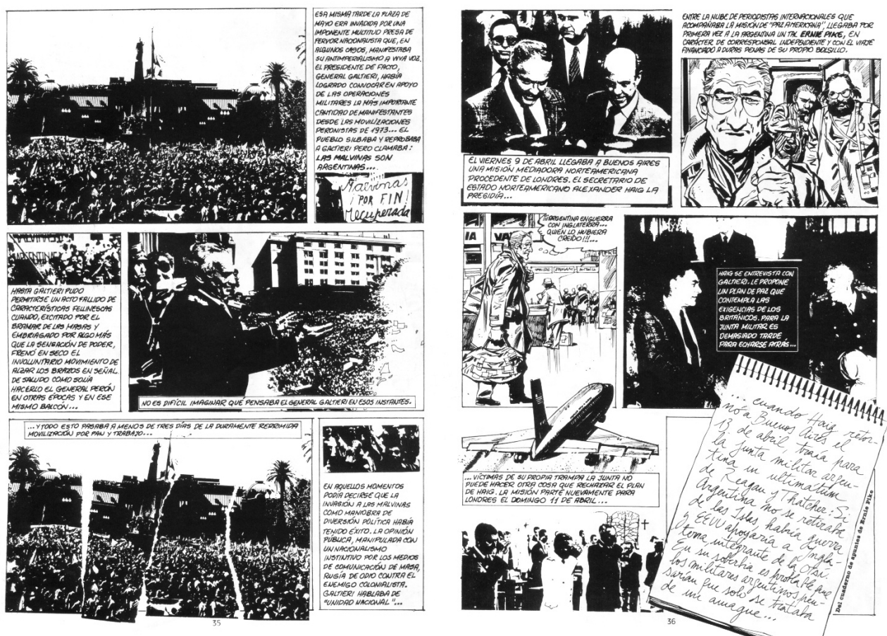
Fig. 1: Sample pages from “La batalla de las Malvinas” (1984/85) showing the stylized reproduction of several news photographs (left page; also panels 1, 4 and 6 on the right page); fictional war correspondent Ernie Pike (top right); Pikes handwritten notes (bottom right).

imperfectly rearranged (fig. 1). This visual technique not only draws attention to the mediality of the reproduced material, making it stand out as originating in a medium different than that of the embedding comic; the physical destruction of the photographic record of the display of nationalism and unity behind a brutal military regime also metaphorically demolishes the mass euphoria, exposing it as the result of the manipulation by the regime rather than a reflection of people’s true concerns: the same people who only days earlier had taken part in a mass protest against the military junta, for “Pan, Paz y Trabajo” (Bread, Peace and Work). Here, the media blending has two seemingly opposite functions: on the one hand, it adds authority to the graphic narrative; on the other hand, the torn photograph questions the ability of photography to produce meaningful records of events. 1 As we will explain shortly, this type of ambiguity is arguably the main reason why the comic was abandoned before it had run its course, as it undermines its overall persuasiveness.