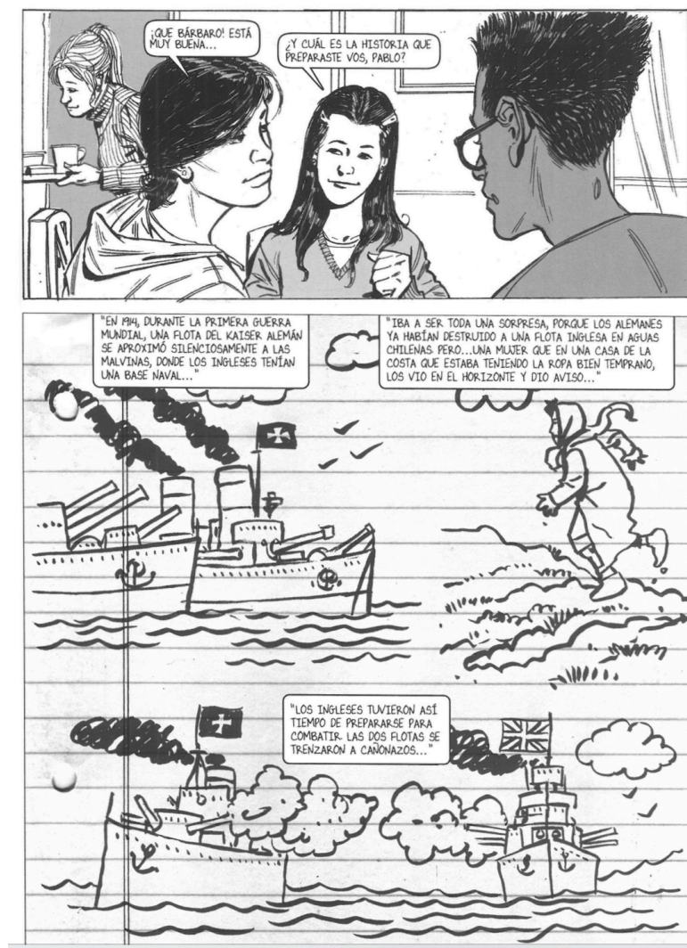
Fig. 5: Page from “Concurso escolar,” in Malvinas: Historias ilustradas (2012). The second panel on this page simulates pupils’ drawings on lined notepaper.

moment of the Falkland Islands' history, summarizing the key aspects of their respective story in the form of simple monochrome drawings on lined notepaper (fig. 5). As observed before, here again the blending of different media adds authenticity to the story, while the narrative frame bridges the chronological gap that separates the historical events from their commemoration. However, it is important to highlight the ambivalence of this framing device: although the frame narratives in these stories rhetorically connect the past with the present, they also distance the reader from the events insofar as they add a prominent narrative layer that serves as the platform for a simple ideological message: that the Argentine invasion of the Falkland Islands was a just and heroic endeavor.