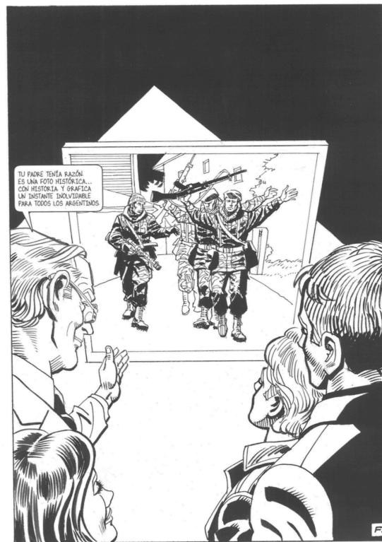
Fig. 4: Final page of "Historia de una foto" from Malvinas: Historias ilustradas (2012). The single full-page panel includes a line art rendition of a widely disseminated photograph of Royal Marines surrendering to an Argentine soldier in the Falklands War (see also Figure 2).

Royal Marines' surrender to Argentine soldiers on April 2, 1982, referred to above. This frame narrative is linked to a photo exhibition on the occasion of the conflict's thirtieth anniversary in April 2012, in which said photograph occupies a prominent place, as it represents and preserves "un instante inolvidable para todos los argentinos" (an unforgettable moment for all Argentinians), as the unnamed photographer comments in the final panel (fig. 4). 6