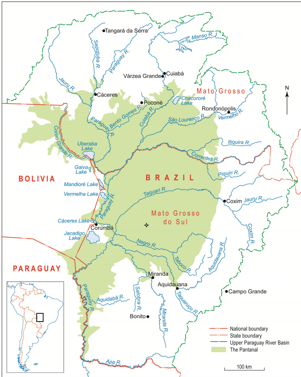
Fig. 1. Location and extent of the Pantanal wetland in South America. The star in the Nhecolândia region depicts the Nhumirim Farm (see Section 2.2 for further discussion); Outline of the Pantanal based on Assine et al. (2015).

(Calheiros et al., 2012; Coelho da Silva et al., 2019). Different authors differ with regards to their assessment in how far these impacts can be mitigated through careful reservoir management, also considering the variation in size among dams (Bergier, 2013; Fantin-Cruz et al., 2015; Zeilhofer and de Moura, 2009), and further research is thus warranted (Coelho da Silva et al., 2019; Sileo-Calzada et al., 2017). Another example are the high levels of mercury in rivers polluted by gold mining activities, which then accumulate in fish and other animals of the local food