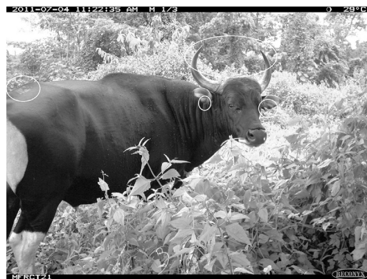
Fig. 3. A mature Bornean banteng bull in Sabah with natural marks (circled) used for identification purposes and to create a recapture history for estimating population parameters.