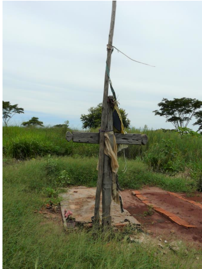
Figure 3 – Graves of Indigenous People Killed by Farmers in Caarapó