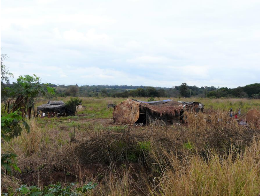
Figure 5 – Retomada in the Vicinity of the Dourados Reserve