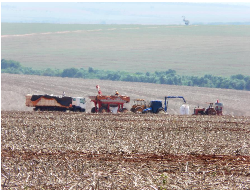
Figure 2 – Agribusiness Production in Southern Mato Grosso in Areas Grabbed from the Kaiowa-Guarani

themselves) and, on the other, marginalised native peoples who have been living in the region for many generations in a context of contrasting relations with land and society. The failure to meet indigenous peoples' legitimate demands and the invalidation of even their most basic human rights are clear signs of the institutional racism that pervades the Brazilian state and of how its ideology of modernisation has been constructed at the expense of, and against, subaltern sectors of society. Instead of legal rights over their land, the Kaiowa-Guarani have only been offered backdoor access to regional space, bearing in mind that since the early 20th century farms have been opened in areas illegally expropriated by farmers and the government. The recurrent violence against the legitimate proprietors of the land – the indigenous groups – is in direct breach of the fundamental principles of the Brazilian constitution. However, the enforcement of the legislation by local judges, civil servants and politicians typically rules in favour of the most powerful economic sectors. This corresponds to the wider problem of non-consensual expropriation of indigenous lands around the world (Doyle 2015).