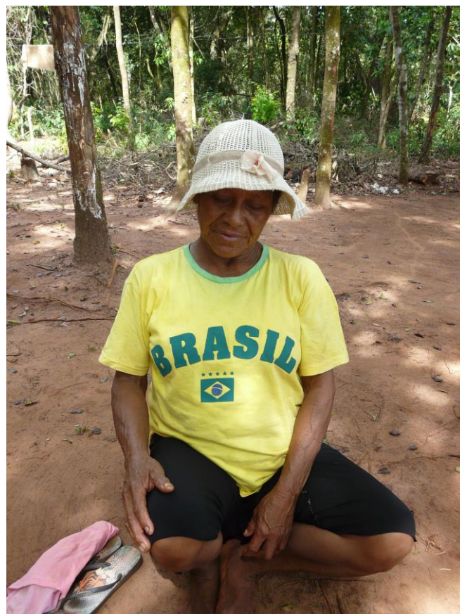
Figure 9 – Indigenous Woman in a Retomada

those traditionally ignored: the descendants of the early inhabitants of the continent, who may hold answers to some of the problems accumulated through a highly uneven process of national development. Indigeneity is a relational construct and, because of the incomplete erasure of colonisation, indigenous and non-indigenous identities co-constitute each other (Coombes et al. 2011). The Kaiowa, other Guarani populations and the more than 300 first nation peoples have a lot to offer in the collective search for a more meaningful way of life. Perhaps a biblical analogy can even be invoked in this context: non-indigenous Brazilians are the prodigal sons and the indigenous the wise fathers (Figure 9). A huge dose of humility and willingness to learn will certainly be needed in order to move beyond the tragic geography of frontier making.