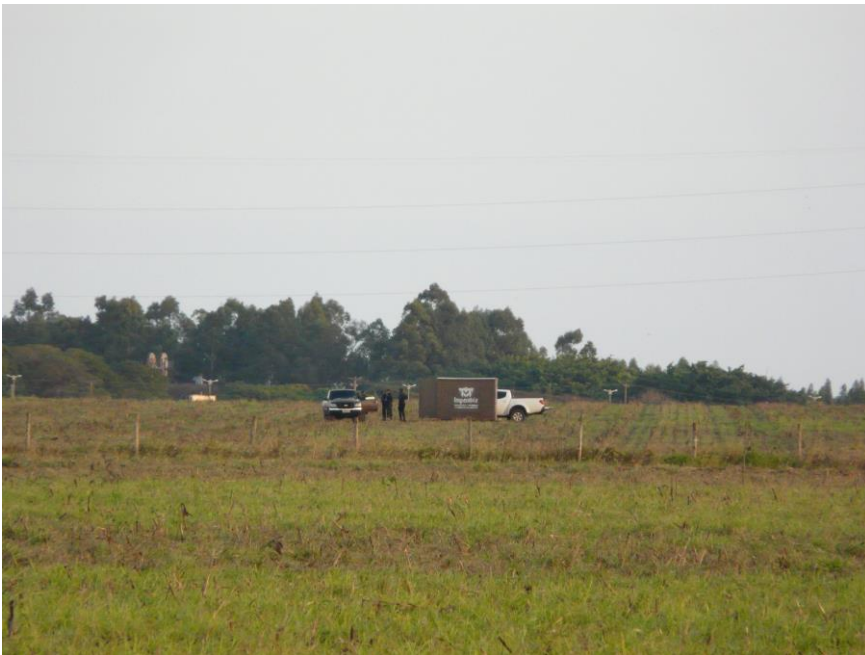
Figure 6 – Private Security Guards (paramilitaries) Hired by Farmers to Contain a Retomada