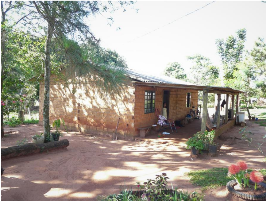
Figure 7.4 – Indigenous Family Household in the Pirajuí Reserve