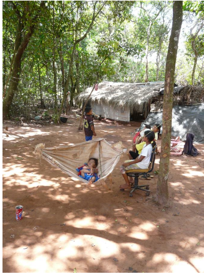
Figure 7 – Indigenous Family in a Retomada in a Soybean Farm in Caarapó