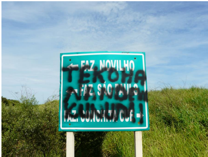
Figure 8 –Indigenous Name of the Land Written Over Farm Signposts

(as Figure 8 shows, the Kaiowa reject the current spatial configuration and use road signs to affirm ownership and the right to name their own land).