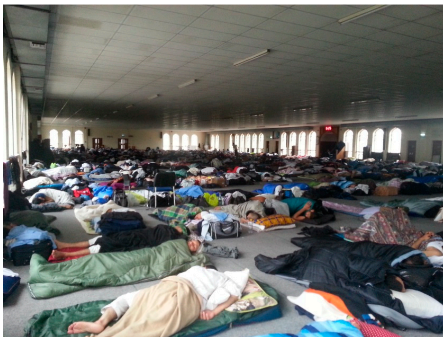
Figure 5. The upper floor of the large TJ complex in Dewsbury strewn, in Ziauddin Sardar’s (2004, p. 2) words, with a plethora of “contended logs” taking their sunna siesta nap during the peak summer holiday period in 2014.