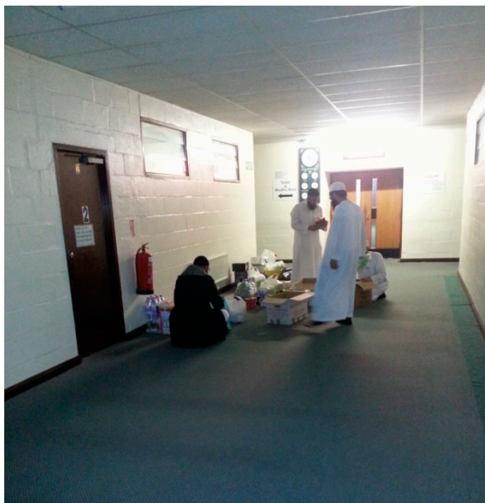
Figure 4. A young British-born TJ group packing their provisions in Dewsbury before departing on an international 40-day TJ excursion in November 2013.