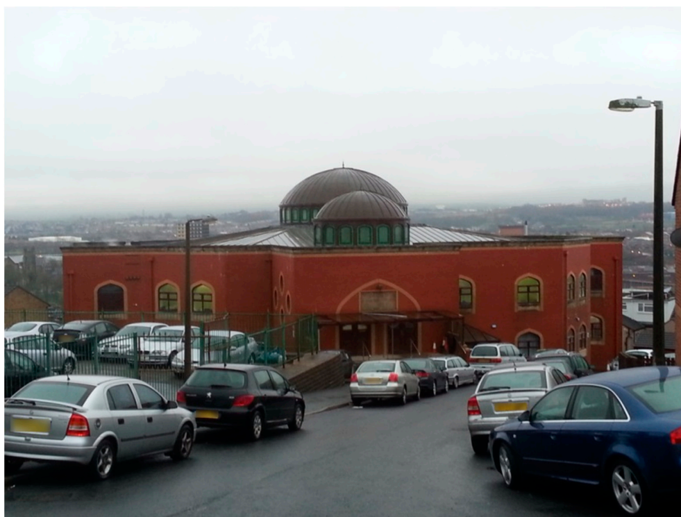
Figure 9. Blackburn Markaz (the number of cars indicating the amount of attendees the weekly programme attracts)

the course of my fieldwork, I attended several Thursday night gatherings at the Blackburn Markaz (see Figure 9), which invariably attracted a largely youthful crowd of up to 1000 Muslims of mainly South Asian origin from mosques across the halqa including Bolton, Preston, Liverpool, Nelson, Lancaster and, of course, Blackburn. 18 Following the lecture, many participants proceed downstairs to the bottom storey of the building where a communal meal is served—usually accompanied by much good-natured camaraderie and jovial chatter as TJ activists from across the halqa (who have often spent time together on extended khuruj outings) catch up with each other and newcomers are gently socialised into the movement. The really dedicated (up to 50–100) stay the night each week, only returning home, or going straight from the markaz to their workplaces, after offering the Friday dawn prayer ( fajr ) in congregation. Given that the night preceding Friday is regarded as being especially blessed, one of the objectives of the overnight stay is to facilitate the rising for the pre-dawn optional tahajjud prayer—a particularly emphasised component of TJ’s devotional cosmology.