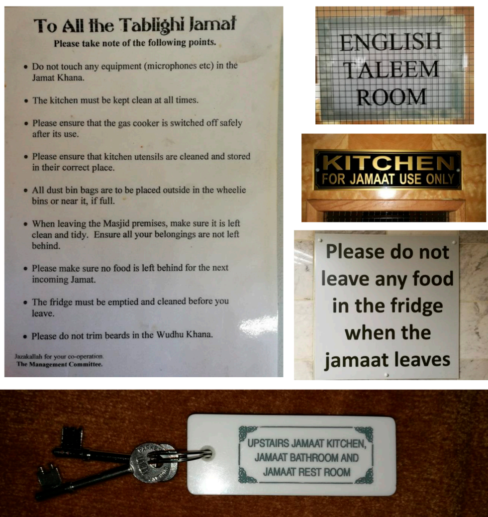
Figure 6. A collection of signs indicating TJ’s entrenchment on the landscape of many British mosques.

By contrast, due to sectarian differences, TJ will effectively be barred from operating in the majority of Barelwi (459 mosques; 23.7%) and Salafi-inspired (182; 9.4%) mosques—although this is not always the case. For instance, while conducting fieldwork in Birmingham during the summer of 2014, I spent a night with a visiting TJ group from Medina, Saudi Arabia 11 that was staying in an Arab Salafi mosque. Local activists informed me that that regional TJ authorities, based at the Birmingham Markaz, make a point of sending only Arab TJ groups to mosques of this kind as the usual groups of South Asian ethnic origin are more readily objected to. The cosmopolitan Al-Rahma mosque in Liverpool may be cited as another example. Founded (and still managed) primarily by Muslims of Yemeni and Somali extraction, it can in no way be considered Deobandi, yet it has a long history of allowing TJ groups to visit and stay, permitting them to deliver their talks after the daily prayers. According to Mogra (2014, p. 189), TJ has, in some UK cities, also achieved limited success in accessing mosques of Barelwi and Ahl-e-Hadith orientation as well as those founded by non-South Asian Muslims who “tend to be sympathetic towards TJ, especially for bringing change among some wayward youths”. Similarly,