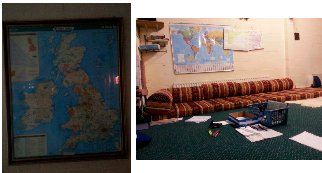
Figure 13. It is noteworthy that national and international maps adorn the walls of the Dewsbury headquarters, although critics maintain that it has failed to engage adequately with the wider society on its doorstep (Lockwood 2012).

The practical ramifications of this glocal activism become evident when considering that eight of my formal interviewees who worshipped in a single mosque in the North of England had, between them, visited, over two decades of staunch TJ commitment, the following countries (usually for a minimum 40-day khuruj but sometimes for a longer four-month outing): America, Argentina, Australia, Austria, Bangladesh, Barbados, Belgium, Bosnia, Brazil, Bulgaria, Canada, Denmark, Fiji Islands, Finland, France, Germany, Greece, Holland, India, Indonesia, Italy, Kosovo, Malta, New Zealand, Pakistan, Panama, Romania, Saudi Arabia, South Africa, Spain, Sri Lanka, Sweden, The Philippines, Trinidad & Tobago and Venezuela. That seven of the eight were British-born further indicates the extent of successful intergenerational transmission of the movement in Britain and exposes the lacuna that exists in extant studies of British Islamic youth activism.