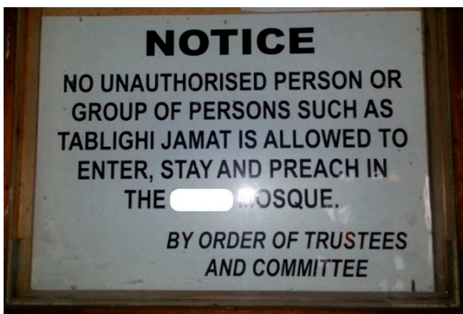
Figure 7. Sign on the noticeboard in a British Barelwi mosque (in terms of the Pakistani context, Ahmad (1991, p. 523) states: “Tablighi Jamaat assemblies are completely banned in the mosques controlled by the Brelvi ulama and their followers”).

Siddiqi (2018, p. 125) finds in Cardiff that the Dar ul-Isra mosque, “affiliated with the ideology of Abul Ala Maududi, the founder of the Jamaat-I Islami”, 12 permits TJ groups to stay and conduct their activities on-site while the Shahjalal and Jalalia mosques, both catering to Muslims of the Bangladeshi Fultoli tradition, allow TJ groups to visit and preach, though not stay overnight. While this calls into question Pieri’s (2012b, p. 9) assertion that “All TJ mosques are Deobandi but not all Deobandi mosques are TJ”, I think it would nevertheless be safe to assume that TJ is completely barred from operating in at least a third of the UK’s mosques (see Figure 7).