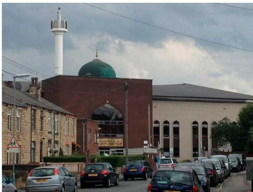
Figure 1. The Tablighi Jama'at (TJ) headquarters in Dewsbury, West Yorkshire.