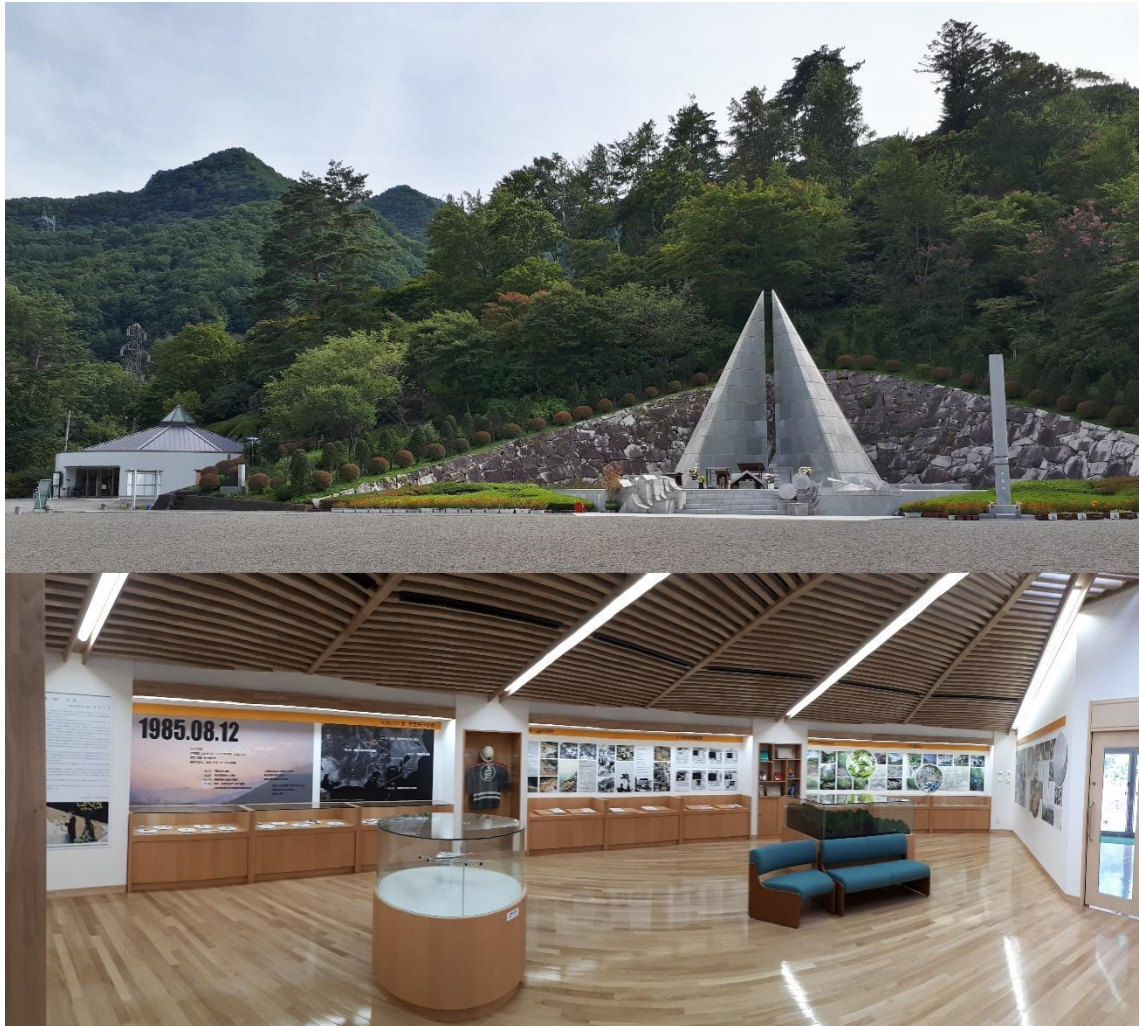
Figure 1 – Irei-no-Sono. Top: The main memorial with the museum building on the left-hand side. Bottom: a view of the main display area within the museum at Irei-no-Sono

the local people and even contains a section about the plants that can be found at the crash site. The modification, which effectively turned the hall into a museum, cost ¥78m (approximately £520,000) (Irei-no-Sono interview September 2017). This modification is more than about making enhancements due to technological changes as has been seen at the Hiroshima Peace Museum over the years, for example (Schäfer 2008, p. 167), as it was a complete revitalisation of how the crash is remembered and done so in a much greater space than before. It is the modification at Irei-no-Sono which is tested against the model developed above.