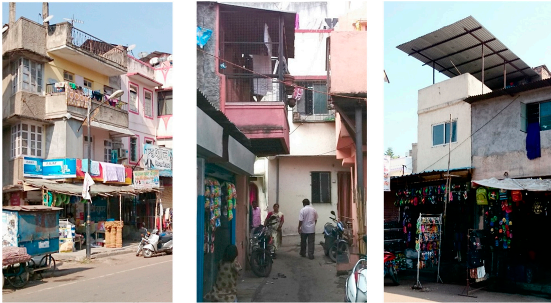
Figure 8. Adding a veranda (left); adding a balcony (middle); adding a roof terrace (right).

One of the other increments of change is where the use of a part of the ground floor changes from residential to shop (Figure 3, upper left). It also changes the ways in which public and private spaces are related to each other. In most cases, a part of the interior space on the ground floor is allocated to a small shop. In effect, an accessible or impermeable interface becomes porous. While the existing floor area remains unchanged, the use of the building changes from residential to a mix of living and visiting. This increment is more likely to take place along the laneways where pedestrian flows attract the emergence of shops. Inhabitants may benefit from this increment in different ways. It provides the opportunity for generating income by renting or creating jobs. It can also contribute to the public space by attracting pedestrian flows and providing the possibility of socio-economic exchange and chance visits.