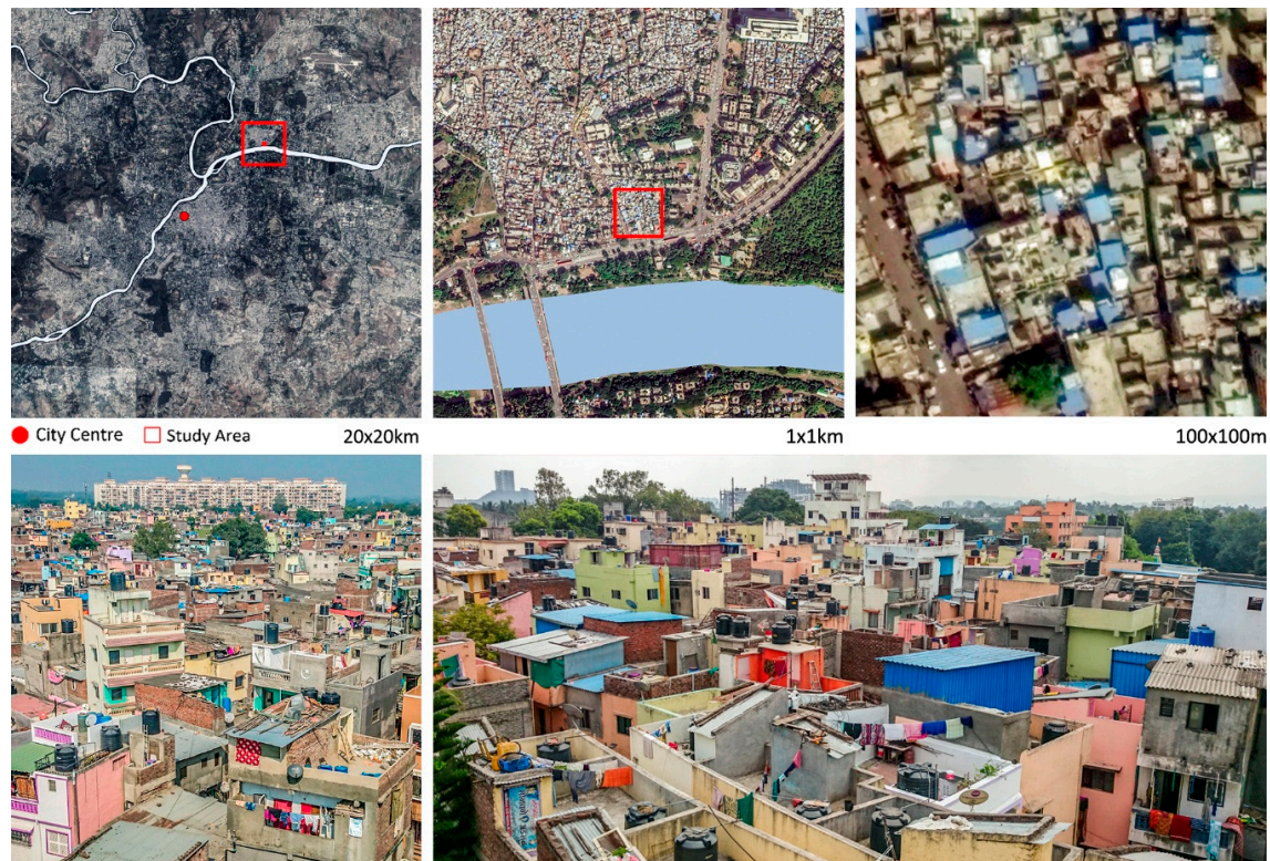
Figure 1. The case study in Pune.

materials that are called pucca [42]. The selected study area is one of the informal morphologies, which is highly dense, irregular and labyrinthine (Figure 1). Undertaking the task of incremental upgrading in such a dense area involved the replacement of certain kutcha structures with pucca ones on the same site and a high level of community involvement.