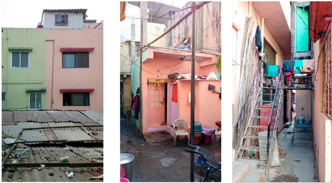
Figure 7. Adding a kutcha room ( left ); adding a pucca room ( middle ), adding an external staircase ( right ).

Adding a room is a typical increment of change in Yerawada. Figure 7 (left) shows the addition of a kutcha room on top of a pucca structure. Another form of this increment is the addition of a pucca room (Figure 7, middle). Adding a room may take place both horizontally and vertically; however, the scarcity of land in such a consolidated settlement constrains the possibility of horizontal additions. In this case, adding a room extends both the living area and building height. Although the addition of a kutcha room is less permanent than the addition of a pucca one, it does not require much investment comparing to the addition of a pucca room. Adding a kutcha room also has the capacity to test potential resistance to vertical encroachments as it enables the possibility of its replacement by a pucca structure in the future. Adding a room also contributes to the generation of more income by providing the possibility of renting if a separate entrance is provided through an external staircase. Adding an external staircase is likely to permanently appropriate a part of public space where there is no setback in front of the building (Figure 7, right). Adding multiple rooms is another increment of change, which may include the addition of pucca and kutcha structures. The required materials are often stored in different parts of the settlement wherever space becomes available under an external staircase, against blank walls or within a setback area.