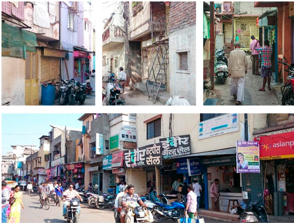
Figure 3. A vertical mix of shops and residential units on the upper floors ( upper left ); a shop along the main laneway with an upper-floor residential unit accessible by an external staircase ( upper middle ); a one-storey shop located at a local intersection ( upper right ); a strip of shops with attached advertisements located along the main street ( bottom ).