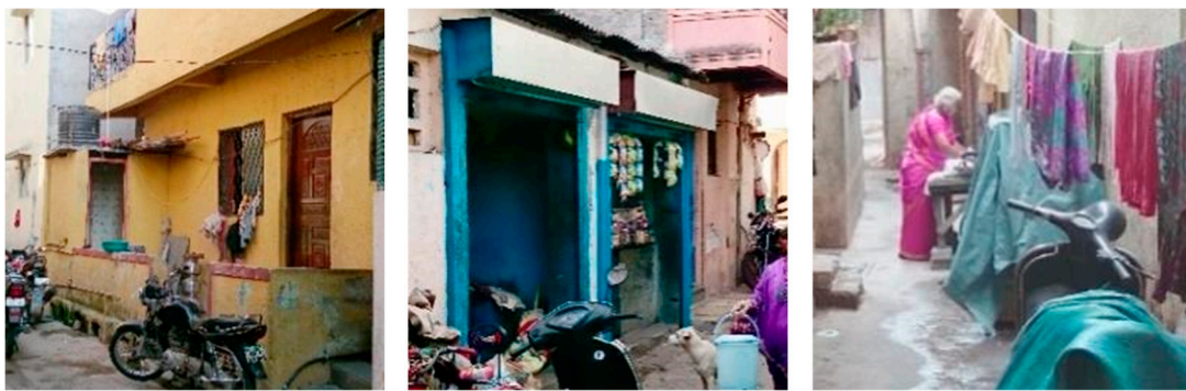
Figure 4. Types of public/private urban interfaces: setback ( left ); porous ( middle ); impermeable ( right ).

Figure 5 shows physical traces from a range of activities and loose parts taking place within a threshold of up to 1 m from the edges of laneways. Loose parts include semi-fixed elements that frequently appropriate parts of the public space, yet on a temporary basis. Most of the loose parts are parked vehicles including motorbikes and bicycles. They often occupy a part of the public space as they are mostly parked in proximity to the houses (Figure 5, left). Storing domestic paraphernalia is a common activity, appropriating a part of the public space (Figure 5, middle). A few traces of growing plants are visible in the house fronts (Figure 5, right). At times, stored furniture and materials are also visible along the laneways. The concentration of loose parts on both sides of the public space often becomes more in deeper parts of the settlement, constraining flows of movement.