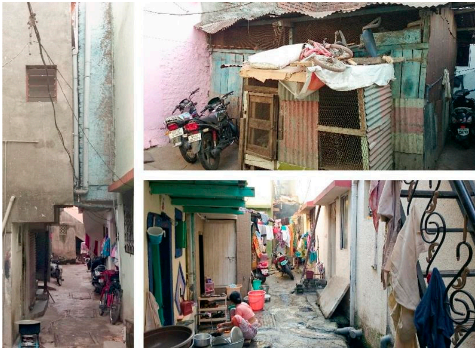
Figure 2. The blockage of sunlight and ventilation ( left ); a one-storey kutcha structure ( upper right ); extending the private activities to public laneways ( lower right ).

linkage between public and private spaces at the ground level through shops and surveillance by overlooking from residential units on the upper floors.