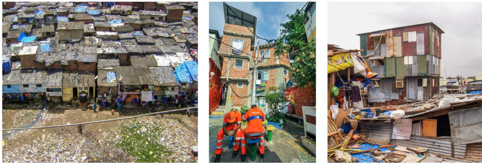
Fig. 2. Room-by-room extensions – Mumbai, Rio de Janeiro, Manila.

ground floor. In such cases the addition becomes a source of income. Most informal settlements are built with the anticipation of additional rooms as soon as resources become available, often signified by reinforcing bars that project from the roof structure in anticipation of a further storey. This increment is primarily responsible for the incremental densification of informal settlements in terms of both buildings and population. It may also directly lead to a shrinkage of public space through horizontal encroachments; there is always a trade-off between private and public territories in informal settlements. In settlements that are already consolidated, extending generally takes place vertically. While vertical additions do not encroach on the area of public space, they may cantilever over public space blocking natural light and ventilation. The addition of rooms within an informal settlement can escalate to the point that public space becomes unlivable and reaches the limit of minimal access functions. The addition of rooms may also change the functional mix if they are used for production or exchange.