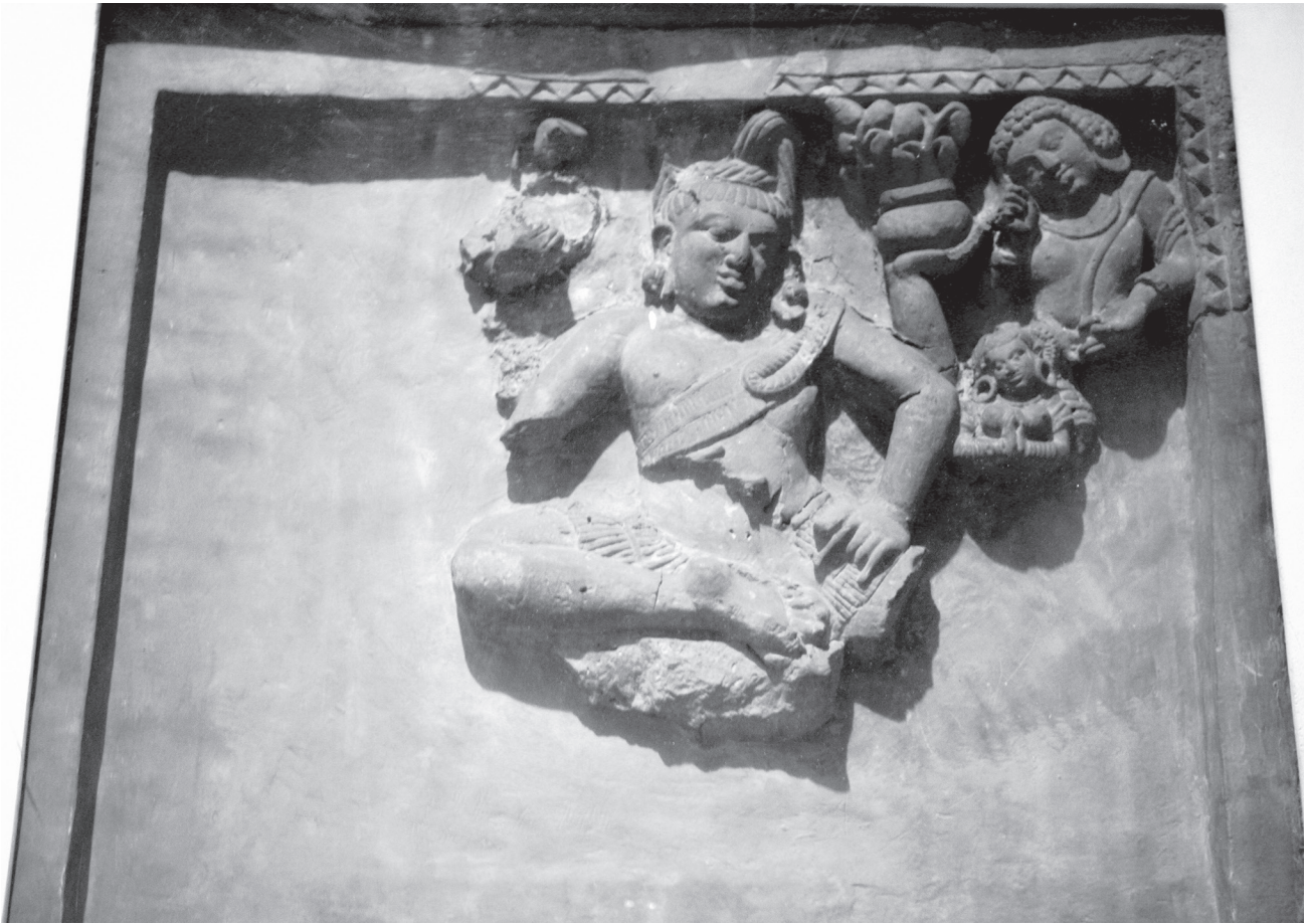
Figure 6: The terracotta plaque from Bhimgaja (Ahichhatra) depicting a four-armed deity together with fragments of a female figure and a male figure. The plaque measures 65 × 73 cm and is housed in the National Museum in New Delhi.

and large hooped-earrings. Her hair is worn in an elaborate plaited style, which, as James Harle points out, recalls the Gaṅgā sculpture from Bhimgaja (Harle 1974, 31). Agrawala's drawing of the plaque shows the no-longer extant thighs of the female figure (Fig. 7). She appears to be standing naked, but for jewellery and a shawl draped around her shoulders. Behind the female figure stands a man with tightly curled hair, head bowed and eyes facing towards the earth. He wears a sacred thread and holds his left-hand palm upwards, facing the deity. His thumb and little finger appear to be touching. His right hand is closed and held below his eye.