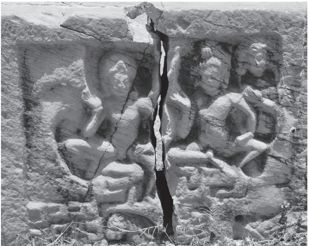
Figure 11: Detail of a sixth-century stone lintel from Nagarī, Chittorgarh District, Rajasthan.