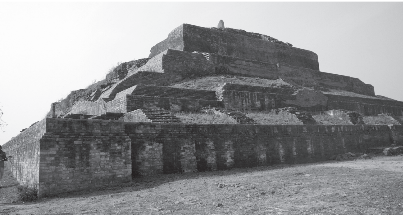
Figure 4: A photograph of the much-restored north east corner of the Bhimgaja monument at Ahichhatra.