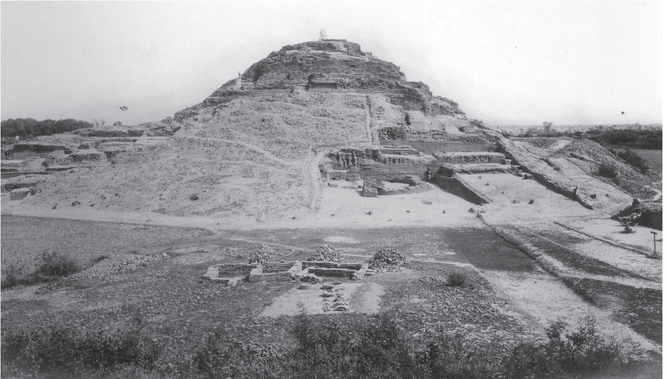
Figure 3: A photograph of the south face of Bhimgaja taken during the 1940-44 excavations at Ahichhatra. At the base of the structure the semicircular wall of a Kuṣāṇa structure can be seen.