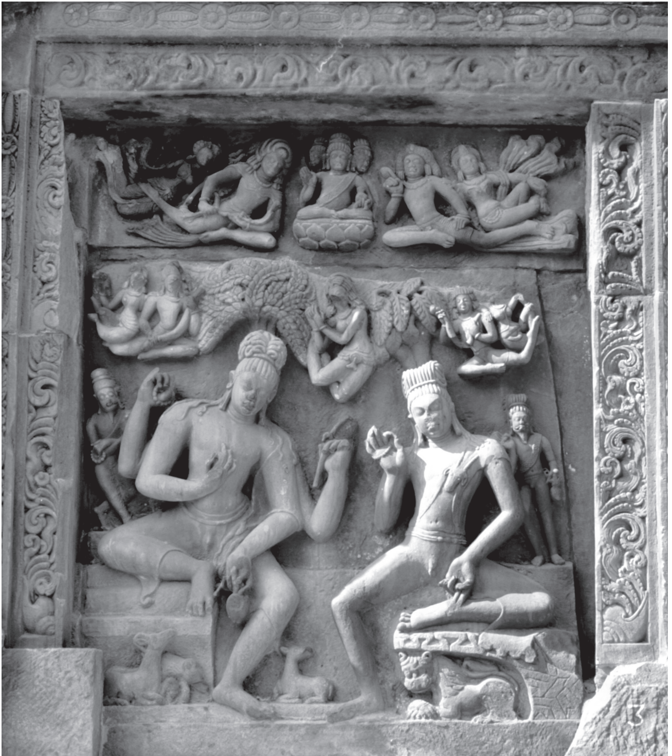
Figure 8: Relief panel depicting Nara Nārāyaṇa on the east face of the Gupta period Daśāvatāra temple at Deogaṛh.

in an attempt to lure them away from their penance. Sage Nārāyaṇa, who had conquered lust and anger, then demonstrated his immense power and detachment by effortlessly creating Urvaśī, the most beautiful apsarā of all, by drawing her outline in mango juice on his thigh. The same identification is proposed here