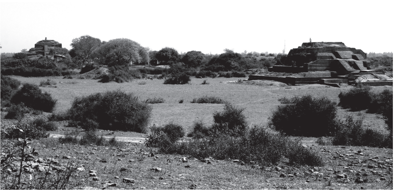
Figure 2: A view of the two pyramidal brick monuments at Ahichhatrā. The structure in the foreground is known as ACII, while the monument in the background is ACI or Bhimgaja. The latter monument is located at the heart of the walled city.

the uninhabited ancient fortress city of Ahichhatrā is intensely atmospheric (Fig. 2). Moreover, beneath its surface lies a wealth of antiquities and structural ruins, which may explain why treasure seekers and archaeologists have returned to this site repeatedly over the course of a hundred and fifty years. Indeed, N.R. Banerjee has commented that 'perhaps no other site in India offers such scope for work as Ahichchhatra does' (cited in Shrimali 1983, 2).