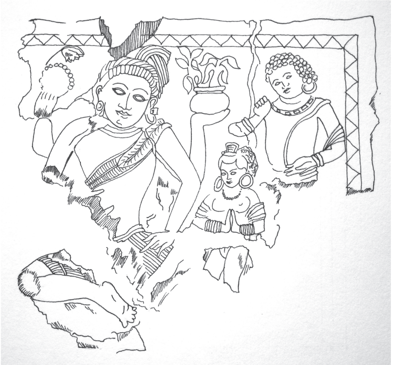
Figure 7: Drawing of the so-called Śiva Dakṣiṇāmūrti plaque from Bhimgaja (Ahichhatrā), after Agrawala 1985, 65.

Agrawala has identified the female figure as a representation of Pārvatī, described in the Kumārasaṃbhava of the Gupta period dramatist and poet Kālidāsa, as waiting upon Śiva for a long period of time while he sat in meditation (Agrawala 1985, 66). Her nudity, however, sits uncomfortably with this interpretation. While Pārvatī is usually depicted naked on her upper half, she is always clothed to a greater or lesser extent from her waist down. Moreover, female nudity is uncommon in Gupta and post-Gupta art as a whole, being more a feature of Śuṅga and Kuṣāṇa sculpture.