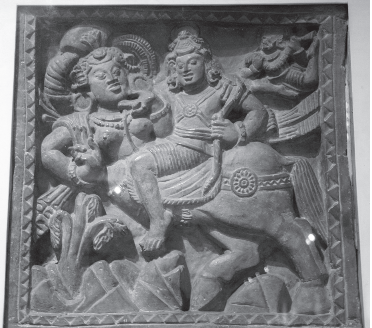
Figure 10: Terracotta plaque from Bhimgaja (Ahichhatrā) depicting a scene with a celestial kinnarī and a male lover with a human form. The plaque measures 64 × 64 cm and is housed in the National Museum in New Delhi.

present in the plaques from Bhimgaja. Lastly, the male figure standing to the right of the plaque is probably an ascetic, perhaps a pupil of the great sages, indeed his role here might be to enhance the sacrosanct nature of the image. As mentioned above similar figures stand behind Nara and Nārāyaṇa in the Deogaṛh panel.