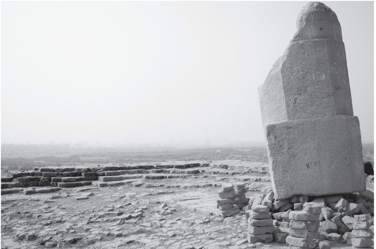
Figure 5: View of the Śiva liṅga at the pinnacle of Bhimgaja, Ahichhatrā.

The record of Cunningham's first visit to Ahichhatrā in 1862 is of great interest since it contains the only extant account of the site prior to any major excavation work. Cunningham provides an invaluable overview of the mounds and tanks within the fortress and in the surrounding areas. Although the report is all too fleeting, it nonetheless makes an important contribution towards the development of a formal understanding of Bhimgaja, most especially since Cunningham illustrated his account with a ground plan of the foundations of a temple that stood at its apex, and of which little now remains. The external measurements of the temple were recorded as being 14.7 m by 8.9 m (Cunningham 1871, 259). Unusually, the monument had open porches on both its the east and west sides in alignment with the staircases of the platforms, and internal corridors which led through to a rectangular garbhagrha (inner sanctum).