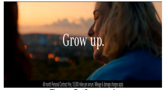
Figure 5: 'Grow up'