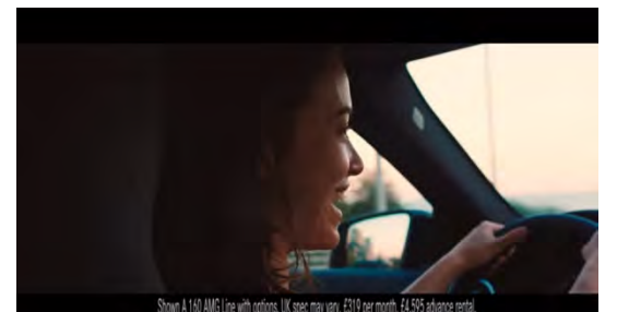
Figure 5: Driving to the beach

This advert consists of four separate scenes: two young women drive to the beach (Figure 5); one of the female characters pours a glass of water on a man's face in public (Figure 6), corresponding to the advert words 'mind your manners'; the female characters dance and appear drunk at a club (Figure 7), accompanied by the narrative voice saying 'go to bed early'. Two female characters make up and watch the sunset together after an argument (Figure 8), implying it is now the time to 'grow up'.