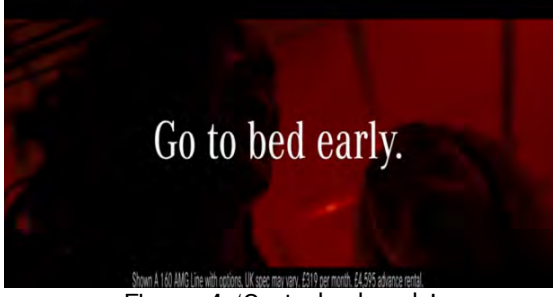
Figure 4: 'Go to bed early'