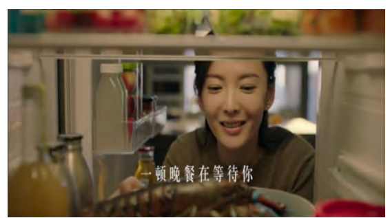
Figure 2: 'A meal is waiting for you'

In the end, coinciding with the background voice 'the more you go forward, the harder it will be; the harder it is, and the more you will go forward' (Figure 3), the advert shows closeups of women's footsteps wearing from high heels to sneakers. In the last scene, the female characters gather together and toast to celebrate - 'they thought you were lonely, but you are not alone. The one who understands you is waiting for you here. To meet your confidence, and see yourselves' (Figure 4). These changing processes of these six female characters shown in the advert are also the transformation of their selfrecognition, connoting the split of the connections with the previous maledominated discourse and the start point of these women's new identities.