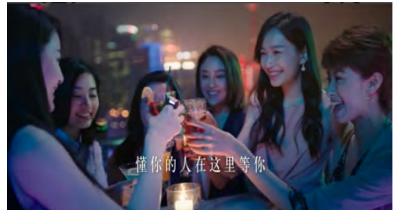
Figure 4: To meet your confidence and see yourselves'