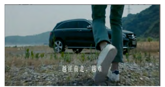
Figure 3 'The more you go forward and the harder it will be'

In the end, coinciding with the background voice 'the more you go forward, the harder it will be; the harder it is, and the more you will go forward' (Figure 3), the advert shows closeups of women's footsteps wearing from high heels to sneakers. In the last scene, the female characters gather together and toast to celebrate - 'they thought you were lonely, but you are not alone. The one who understands you is waiting for you here. To meet your confidence, and see yourselves' (Figure 4). These changing processes of these six female characters shown in the advert are also the transformation of their selfrecognition, connoting the split of the connections with the previous maledominated discourse and the start point of these women's new identities.