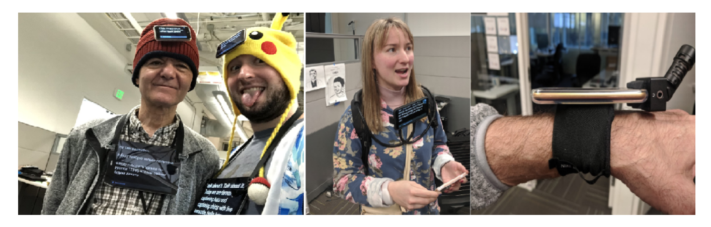
Figure 4: Wearable innovations for Live Transcribe Interaction. Left: head and chest wear. Center: chest wear. Right: wrist wear.

ASSETS '20, October 26-28, 2020, Virtual Event, Greece