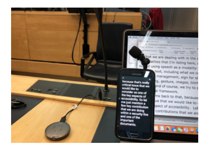
Figure 3: CART on a computer screen, Live Transcribe on a smartphone, and the round Roger Select (an assistive listening device)

DHH people often have particular speech characteristics associated with hearing loss, often referred to as "deaf speech". Research has explored the characteristics of deaf speech and various methods to improve articulation of deaf speakers, which is typically managed by speech therapists [5, 7, 19]. Practice with a speech therapist is inherently intermittent, however, and the therapist is not always available to correct a speaker's pronunciation. In the following experiences, Live Transcribe has been used as a tool to determine whether the deaf speaker's articulation is sufficiently accurate to be recognized correctly. Where it is not recognized correctly, the deaf speaker can dynamically tweak their own pronunciation until it is recognizable.