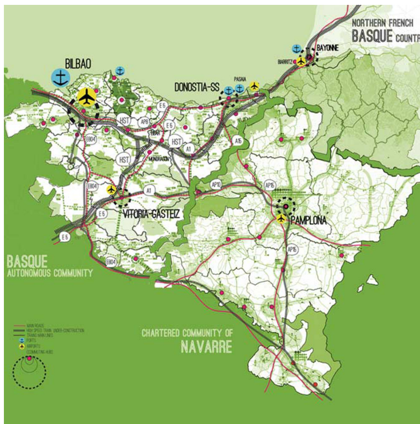
Figure 2 | Bilbao as the metropolitan political hub and the Basque Country as the city-regional political response in reference to Spain. [Permission granted to be published under an Open Access license (CC-BY)]. Source: http://cityregions.org/comparative-territorial-connection/empirical-approach/basque . This figure is covered by the Creative Commons Attribution 4.0 International License. Reproduced with permission of Dr Igor Calzada, MBA ( www.cityregions.org ); copyright © Dr Igor Calzada, MBA ( www.cityregions.org ), all rights reserved.

further fiscal devolution (Devine, 2001; Burn-Murdoch, 2017; Scottish Cities Alliance, 2017). Glasgow has gained metropolitan and international visibility that accompanies a sharper political profile and distinct democratic standing (Geoghegan, 2015; Clark et al. , 2016). In both referenda for independence and Brexit, Glasgow set the main trend (Macwhirter, 2015; Clark, 2016; Hassan, 2016; Calzada, 2017b). Thus, even though independence/secessionists were defeated by the small margin of 45% vs. 55%, the rational way in which the independence debate occurred demonstrated constructive pros and cons that were not seen in Catalonia (BBC News, 2014; Basta, 2015; BBC Radio, 2015). However, after the Brexit vote, in the “age of devolution”, there is the question of how to respect the people of Scotland’s vote to remain part of the EU.