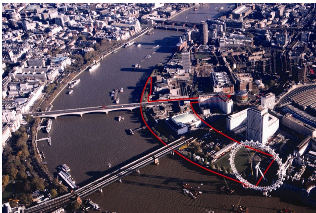
Figure 2. The Southbank Centre (SBC) site context.