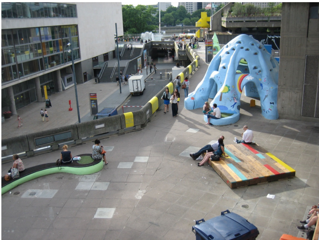
Figure 4. The high-level walkways level 1 in 2013.

During fieldwork, we focused our attention on three particular walkway locations: the walkway segment between the QEH, PR and HG both below and above street level, namely ground floor and levels 1 (Figures 4 and 5) and 2, the roof terrace (Figure 6). The three locations were at the centre of attention of the media since the winning Festival Wing proposal of FCBS architects was shown in 2013 at a public consultation. Their proposal was surrounded by a very heated debate because of their intentions to insert in this space two big glass pavilions—a vertical one in between for rehearsing orchestras and a new central foyer, and a horizontal one along the Waterloo bridge. The main opponents to this proposal have been conservationists such as the Twentieth-Century Society, architectural critics, the director of the National Theatre, and the SBC's regular users [SBC Anonymous Users Interviewees].