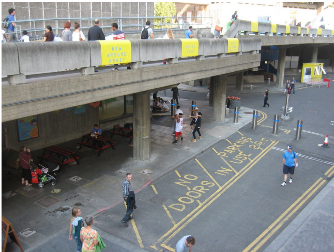
Figure 5. Under the high-level walkways in 2013.