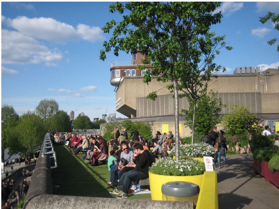
Figure 6. The high-level walkways level 2, roof terrace in 2013.