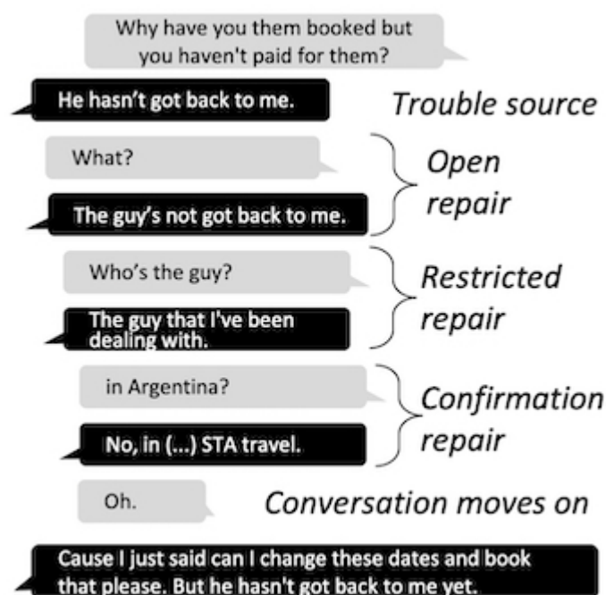
Figure 1: An example of an extended repair sequence, based on Rossi Corpus of English, RCE08 20000a-c (Rossi & Kendrick, 2013).

In real conversations it is often the case that people do not understand or simply do not hear each other. To help us deal with this, we have systems of ‘repair’ that get the conversation back on track (Schegloff, Jefferson & Sacks, 1977; Dingemanse et al., 2015; Micklos, Walker & Fay, 2020). These systems are quite predictable. For example, in Figure 1 below, A and B are discussing the booking of holiday tickets: