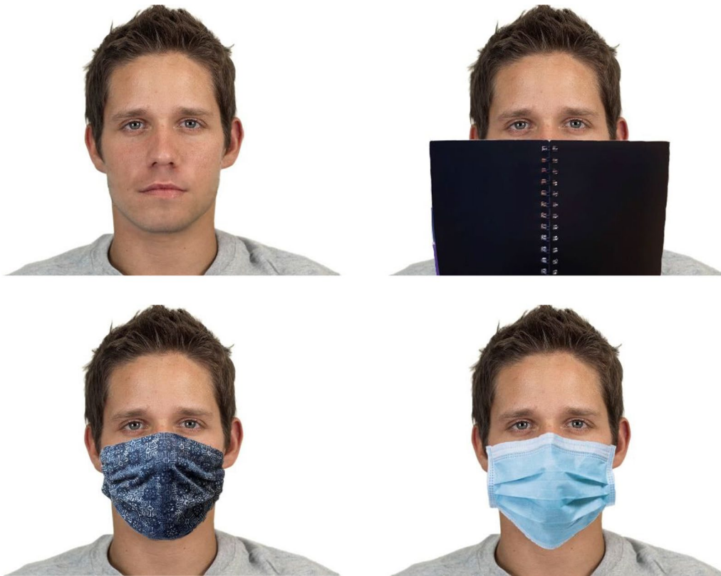
Fig. 1 Examples of the four types of stimuli used. Top left: Full face. Top right: Notebook. Bottom left: Cloth mask. Bottom right: Medical mask. The original CFD image is reproduced with permission

then individually presented to participants in a random order. Therefore, each participant was presented with each face four times (medical mask, cloth mask, book, non-occluded). Participants rated the faces using the number keys 1–7.