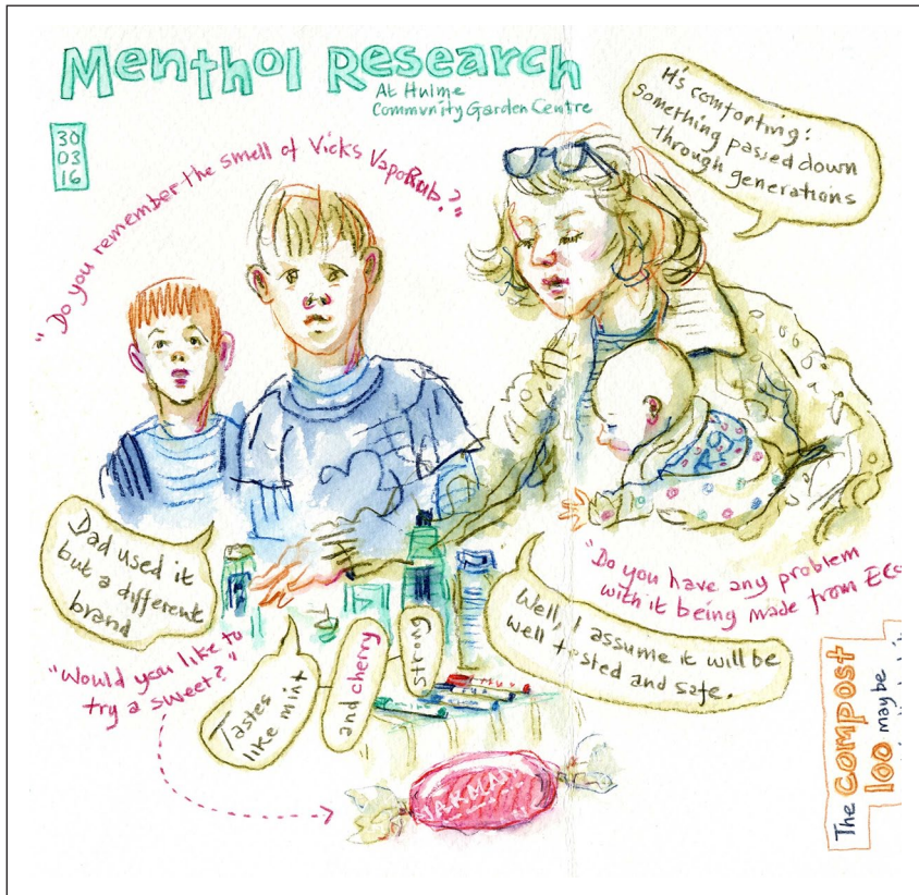
Figure 6. A mother and her three children engage with pop-up stall objects.

locations within the home. While the chemical and physiological effects of menthol on cold symptoms are debatable, and parents are often themselves unconvinced of their scientific or medical valence, the feeling that one is being cared for, and has been recently cared for, is far more important when seen from a moral practices perspective. The warming, cooling, tingling, ‘opening up’ sensations of menthol contribute across the country, night after night, for tired parents and uncomfortable children, to the alignment of a family’s evening to the extraordinary caring ideal of good parenting and of a good childhood.