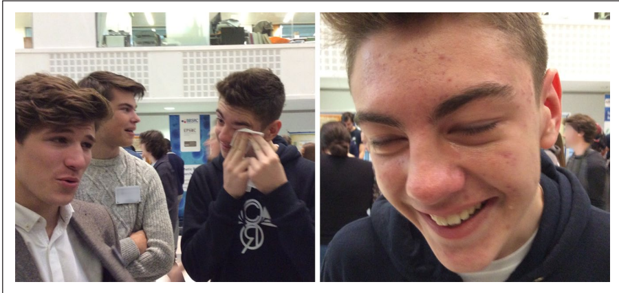
Figure 3. Teenage boys recover after playing a game of menthol one-upmanship, and a close-up of tears streaming down a young man's face.

material, sensory dimensions of vapour rub provided a means to competitive playfulness around their toughness. Lyman (1998) argues that such games allow men to negotiate their affection, tension and aggression towards each other, for example, as can be seen in the context of American frat culture. For our participants, menthol was used to secure the moral order around masculine performances of care, but via the inversion, and thus manifestation, of the ordinary imperative of avoiding self-harm. Manifesting for others, in the form of tears and blotched cheeks, their temporary refusal of their moral obligation to themselves, the young men negotiated the boundaries and tolerances of their bodies' toughness, through play. Harming themselves with menthol sat in clear distinction to their previous performance of more 'feminine' ways of appreciating the products. In doing so, they used menthol to display for each other, and for the researcher who had told the story in the first place, their conformation to idealised notions of masculinity.