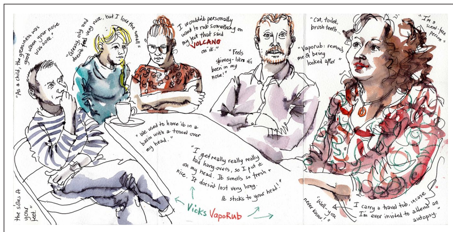
Figure 4. Participants in a focus group discuss menthol products.