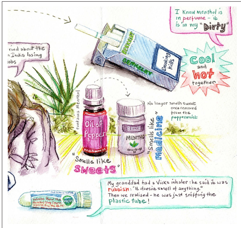
Figure 5. Objects used at the pop-up stalls and some of the participants' immediate reactions.

More consistent was the way in which those immediate experiences, however diverse, tended to segue into explanatory talk accounting for the way the participant had responded, which very often invoked memories of family. For example, smelling a vapour tube for delivery of menthol to the nostrils, one participant smiled and immediately told an anecdote about how her grandfather was frustrated that the menthol did not smell of anything, only to later find that he had been sniffing the plastic tube without unscrewing it.