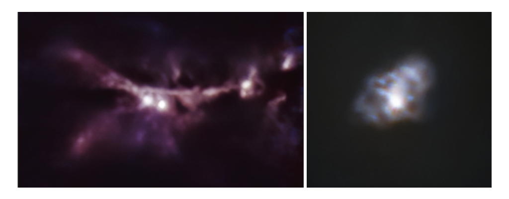
Figure 3. First results of the CONCERTO scientific commissioning. Two observations of continuum emission are shown as observed by the two bands of CONCERTO (1). Left plot: star forming region NGC6334 (Cat Paw Nebula) mapped in a field of 37 \times 25 \, \mathrm{arcmin^2} for 16 minutes of integration. Right plot: Crab nebula observed with 2.5 minutes integration time mapped in a field of 10 \times 10 \, \mathrm{arcmin^2} . In both cases we represent composite images where the LF array is in blue, and the HF array in red.

Here we presented preliminary results of the scientific commissioning showing estimates of the instrument performance well in agreement with expectations.