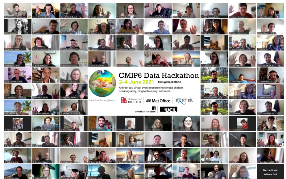
Figure 1. Group photo of the CMIP6 Data Hackathon Participants that took place virtually from 2 to 4 June 2021.

Project 1 focused on sea level rise (SLR), one of the more certain consequences of global warming. However, predicting the amount of future SLR is complicated because multiple different parts of the climate system play a role, each of which has a different sensitivity to external forcing and a different time constant for a response. Typically, each component – glaciers, ice sheets, land hydrology and thermal expansion of sea water – has been calculated separately and summed to produce a global estimate. A different approach examines the response of sea level to a centennial change in temperature from both historical observations and climate model projections, termed the transient sea level sensitivity (TSLs). A recent study estimated the TSLs for the IPCC Fifth Assessment Report (AR5), the Special Report on the Ocean and Cryosphere in a Changing Climate and historical data (Grinsted and Christensen, 2021). Some CMIP6 projections, however, have a greater sensitivity to greenhouse gas forcings than previous climate models (e.g. Zelinka et al. , 2020) potentially affecting the TSLs. This group