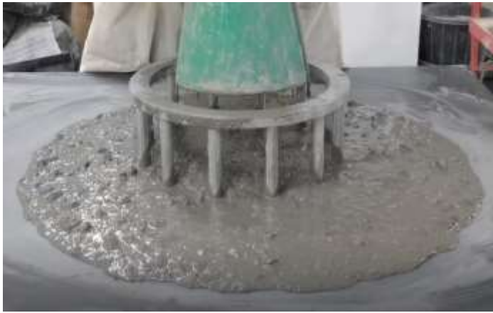
Figure 2. An example: J-ring flow test of 70A