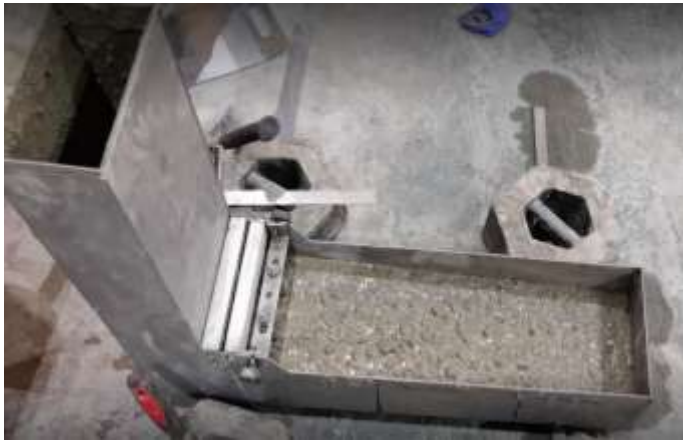
Figure 3. An example: L-box flow test of 90A

The results from the slump flow test are given in Figure 4 which illustrates that as the S/A ratio is increased from 0.48 to 0.53 (while keeping the volume fraction of total aggregate constant and maintaining the paste volume constant for each series), the slump flow diameter decreased. This result is in agreement with the experimental study presented in [14]. This could be