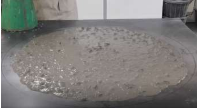
Figure 1. An example: slump flow test of 80B