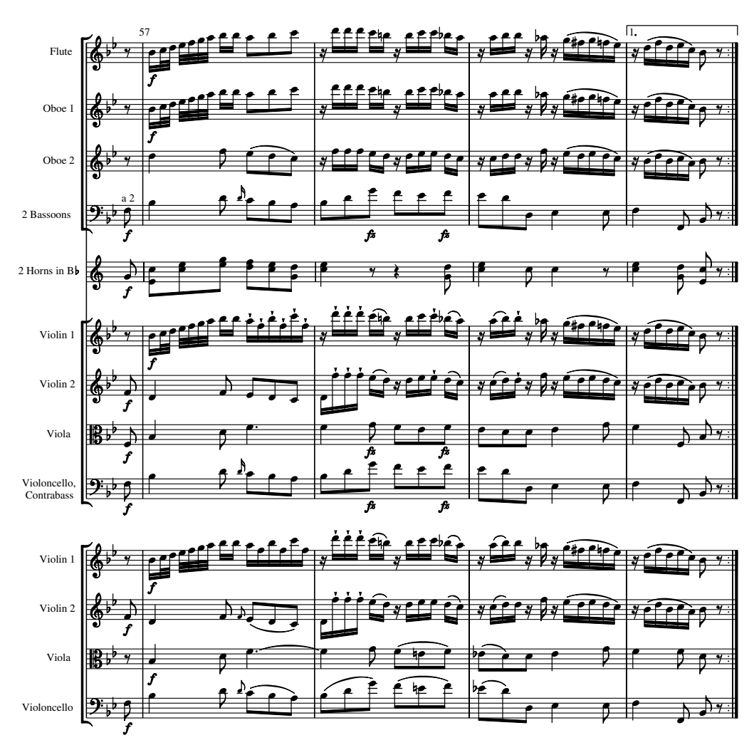
Example 4 Symphony No. 84/ii, bars 57–60 ( Joseph Haydn Werke , series 1, volume 13: Pariser Sinfonien , 2. Folge , ed. Sonja Gerlach and Klaus Lippe (Munich: Henle, 1999)). Used by permission. Quartet: Artaria (1788)

The complete autograph scores of two of the symphonies, Nos 84 and 86, survive.<sup>37</sup> Two instances of second thoughts in the autograph score of No. 84 are revealing. Example 4 presents the symphony version and the quartet version of a passage from the Andante. The most significant difference is the change in the thematic bass line in bar 58, from E_{\uparrow} in the symphony to E_{\uparrow} in the quartet. At this point the autograph score of the symphony contains evidence that something was erased before this note; that it was a natural sign is suggested by another erasure in bar 59 before the first note, probably of a cautionary flat sign.<sup>38</sup> The compositional history of this change in the autograph score of the symphony is easily reconstructed. The movement is a set of variations that had contained this E_{\uparrow} in the original theme (bars 2 and 6) and most of the equivalent points in the two major-key variations (bars 30, 34, 46 and 50). (The first variation is in the tonic minor and, consequently, harmonically recast.) When Haydn came to write the thematic line in bar 58,