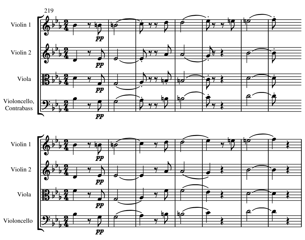
Example 5 Symphony No. 84/iv, bars 219–225 ( Joseph Haydn Werke , series 1, volume 13: Pariser Sinfonien , 2. Folge , ed. Sonja Gerlach and Klaus Lippe (Munich: Henle, 1999)). Used by permission. Quartet: Artaria (1788)

his first thoughts were to use the E \natural but the decorative semiquaver patterns in sixths in the upper voices were producing clashing E \flat s; to avoid the semitone dissonance he erased the natural sign in the autograph and the now redundant cautionary flat sign in the following bar. In the quartet version the E \natural survives.