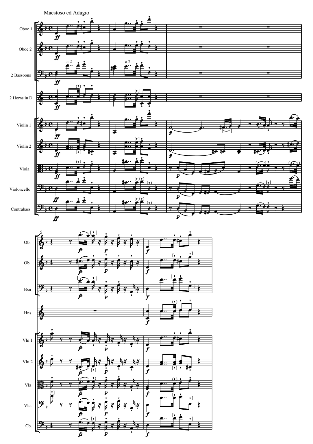
Example 1 The Seven Last Words, Introduzione (Joseph Haydn Werke, series 4, Die Sieben letzten Worte unseres Erlösers am Kreuze, Orchesterfassung, ed. Hubert Unverricht (Munich: Henle, 1959)). Used by permission