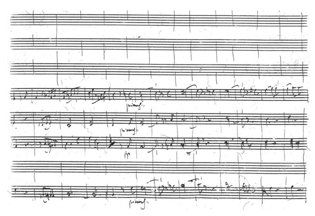
Figure 2 Page from the autograph manuscript of Haydn, Symphony No. 84/iv, bars 215–217.

bass line) has an E $\sqrt\$ in bar 58 of Example 4 and, consequently, a cautionary E $\sqrt\$ in bar 59; and in the finale the length of the note of resolution in the various string parts is mainly crotchets. This line of transmission – from autograph score via manuscript parts to printed parts – would allow the earlier theory that the subsequent quartet version was instigated by Artaria and was based on a new score prepared from either the manuscript parts or the recently engraved orchestral parts.