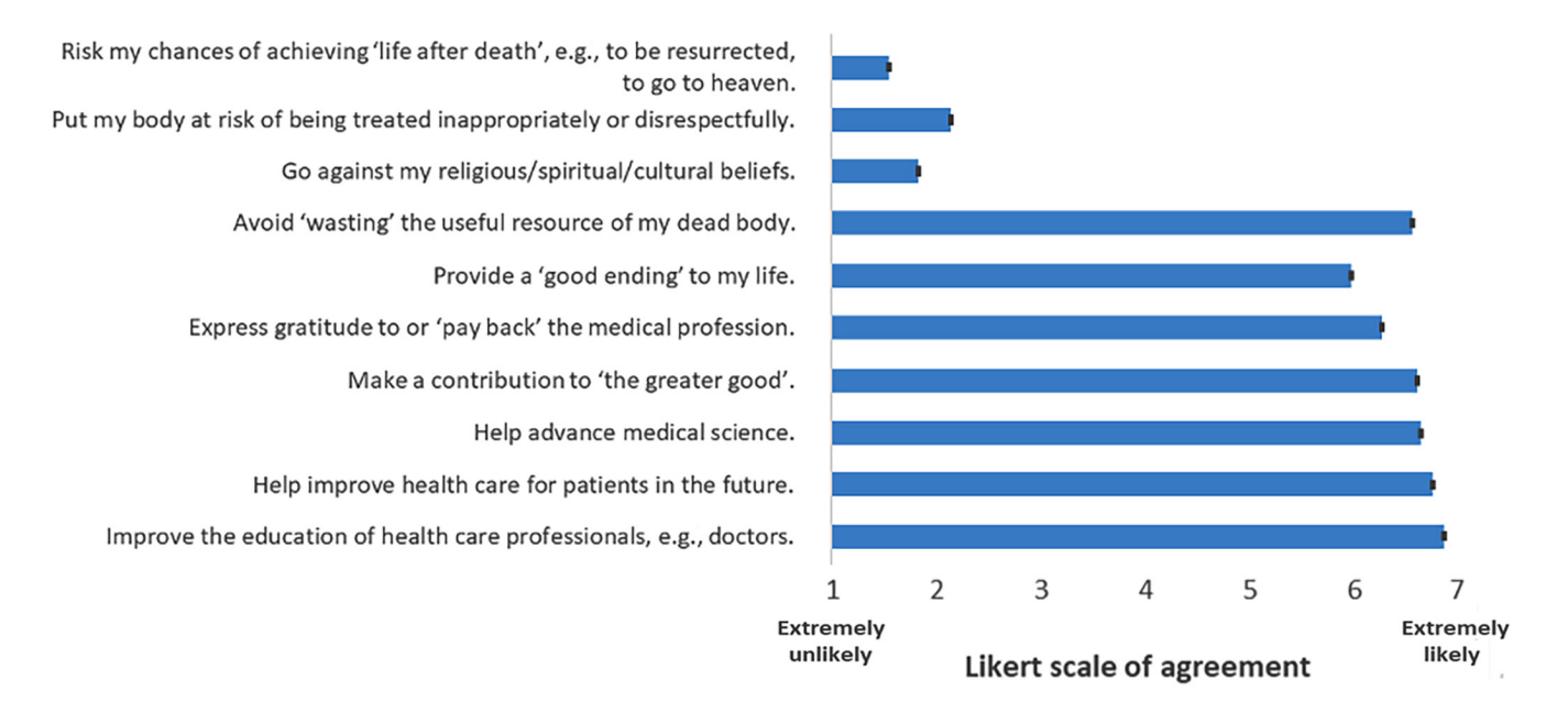
FIGURE 1 Bar chart showing attitudes of potential body donors regarding a variety of donation attitudes. Becoming a body donor would: Participants were asked to rate the statements on the seven-point Likert scale from extremely unlikely (1) to extremely likely (7). The responses demonstrate that potential body donors are predominantly in agreement regarding all the attitudes covered in the figure. Error bars are \pm standard error of the mean (N = 559-824).

choosing extremely likely when asked if most people who are important to them probably agree that they should become a body donor. However, only 51 (6.45%) felt this extremely unlikely.