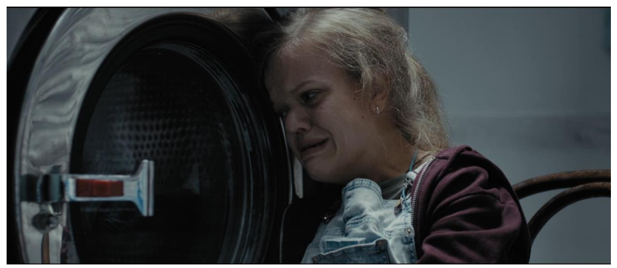
Fig. 3 . Screenshot from The Dress : Introspection Follows Julia's Coming Out as a Sexual Being

Demanding inclusion as a sexual being has put her in touch with her own feelings, not only about sex, but about what it is like to confront the sensation of continually being othered: