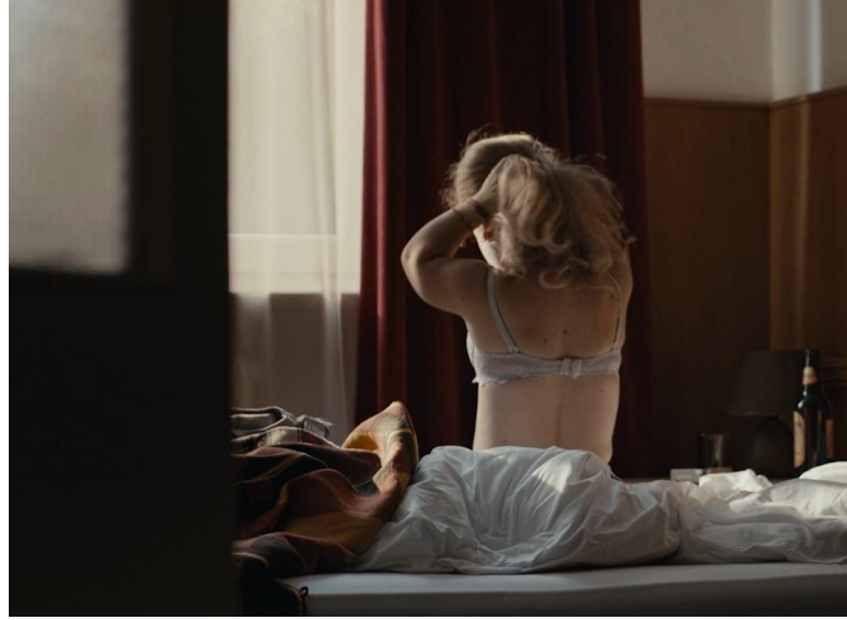
Fig. 4a . Left, Edgar Degas, Woman Combing Her Hair (1888-90); Fig. 4b Right, Screenshot from The Dress

Like paintings by Degas and Bonnard this scene dramatizes an innate tension between an artistic interest in a woman's private moments and voyeurism. Here, though, the tension has added to it the fact that the woman is the subject of staring and voyeurism by dint of her disability as well as her gender. The framing of the shot—we see Julia on another plane, further away from us than the one that describes an internal structural partition—is also evocative of the orientalist iteration of la toilette —i.e., viewing women as they go about their ablutions in a screened interior. Does this reflect, perhaps, an unwitting displacement here of exclusion by exoticisation? The genre of la toilette creates an allure around the mystery of the subject's essence and here, perhaps, the aestheticization serves to channel the mystery of the trope as a way of remaining at a distance from a disabled subject. The framing of this scene is repeated at the end of the film, when Julia, now herself the voyeur, looks in on an interior where, this time, woman is configured not in an orientalist idiom, but as