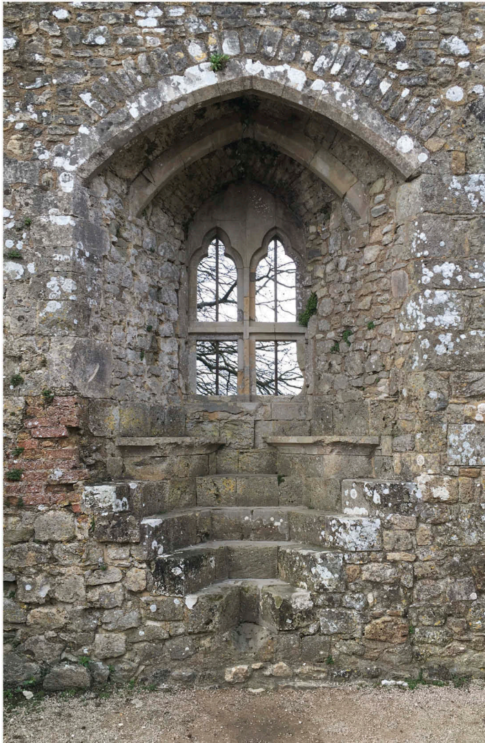
Figure 6. 'Isabelle's window' at Carisbrooke Castle © Historic England Photo Library.

(Young 2013). In addition, there is 'Isabella's window'; a visible building element on the visitor route (Figure 6). The naming of this feature can be traced to at least the late nineteenth-century, its good condition can perhaps be attributed to this early assignment and acknowledgement of historical importance. This window opening is located in the north curtain wall and once formed part of Countess Isabella's great chamber. Of the extant buildings and structures of the castle, it is not the only one that can be associated with this period and there are other buildings that could be considered to be more significant, such as the earliest phase of the gatehouse, the great hall and remnants of a chapel. However, in contemporary assessments of value, the level of significance that the window currently enjoys ensures that it is a priority for conservation. It is always presented to the highest standard: clear of vegetation to ensure legibility and structurally stable to ensure longevity. For modern visitors, the window's name is a signifier of a prioritized story and building element. Ultimately, it conveys a message that this element is noteworthy, as is the associated individual. The window provides the visitor with a tangible connection to Isabella's life where they are encouraged to imagine her presence at that particular location, thereby ensuring that her story remains prominent.