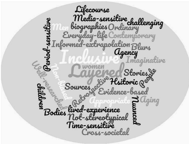
Figure 1. Wordcloud of 'Good' Gender interpretations.

'Including women' also featured prominently. Some groups engaged more directly with current theoretical trends of what 'gender' means, noting the importance of the body, life course and cross-societal approaches.