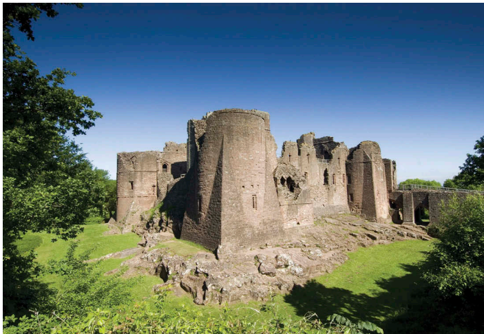
Figure 4. Goodrich Castle, Hereford

These extensive buildings are complemented by three remarkable documents, dating to 1295–97: accounts listing the daily household expenditure of Countess Joan de Valence, widowed in May 1296 and now the head of the household (TNA E101/505/25,/26 and/27). The accounts are well-known to social historians and have been mined for information by scholars including Mertes (1988), Woolgar (1999) and most recently Mitchell (2016), author of the only dedicated biography of Countess Joan. The accounts followed a standard formula, listing the outgoings of each household department on every day, and indicating the mistress’s location, with the identities of close relations and guests staying with her. The location clauses show that during the period covered by the accounts, Joan stayed at Goodrich Castle for six months between November 1296 and May 1297, and again in September 1297, when the account ends. Most of these daily entries were concerned with the consumption of foodstuffs, but they contained details of occasional purchases, such as a lantern for the kitchen window, and a canopy for the mistress’s bed. They also provide information about the activities of household members – Philip, a clerk, travelled to Chepstow to buy fish, Thomas the chaplain bought wax at Monmouth. Finally, and most usefully, the accounts also listed at intervals members of an inner core of servants and officials who travelled with the Countess: the chapel clerk, Humfrey of the mistress’s chamber,