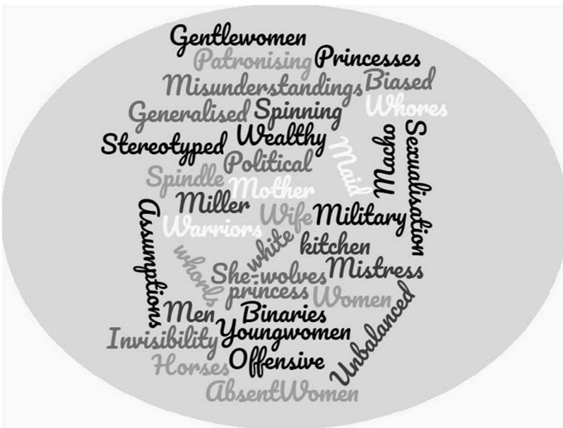
Figure 2. Wordcloud of 'Bad' Gender Interpretations.

Overall, it seems that imagining what 'good' gendered interpretations looked like, proved a lot easier than discussing the 'bad'. There were some differences of opinion around the fairness of listing gendered interpretations as 'bad' because they were simplistic or did not capture the extents of different gender identities. These were viewed as 'a good effort', reminiscent of second wave feminism and the 'add women and stir' approach (Tringham 1991). There was a consensus across all groups that merely including women in a superficial way was a 'bad' interpretation, despite the fact that most groups had defined a 'good' gendered interpretation as 'including women' (Figures 1 and 2). The results of this breakout