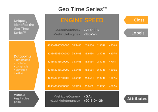
Fig. 2. Warp 10<sup>TM</sup> Geo-Time Series representation

The Warp 10<sup>8</sup> core platform is built to manage and simplify time series processing. It includes a Geo Time Series<sup>TM</sup> database and an analytic engine. Each one can be used separately but of course can be combined they work great together. Each measurement has a specific time, a value and optional spatial metadata such as geographic coordinates and/or elevation. Those augmented measurements are what we call Geo Time Series<sup>TM</sup> (GTS).