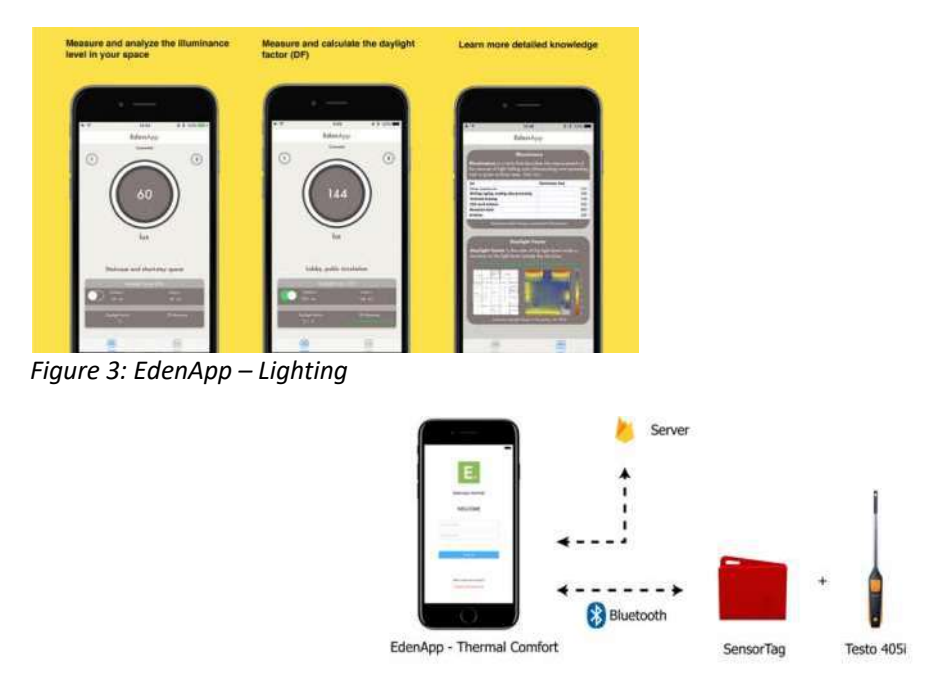
Fig. 4: EdenApp – Thermal Comfort

The price, feasibility, stability and connectivity will all influence the accuracy of reading and student's user experience. Since we realised that sensor had become a crucial part of the whole learning process, based on Smart Thermal Comfort (STC) sensor box (Zhao et al. , 2018), we developed a portable version which could measure air temperature, globe temperature, relative humidity, hot-wire air velocity and illuminance (Figure 4 left). It could give users an accurate real-time environmental data dashboard. To further increase mobility, we used Arduino-based circuit and Bluetooth Low Energy (BLE) technology to made the latest version of portable EdenApp sensor box and fully integrated with mobile app (Figure 4 right). It cost only £40.