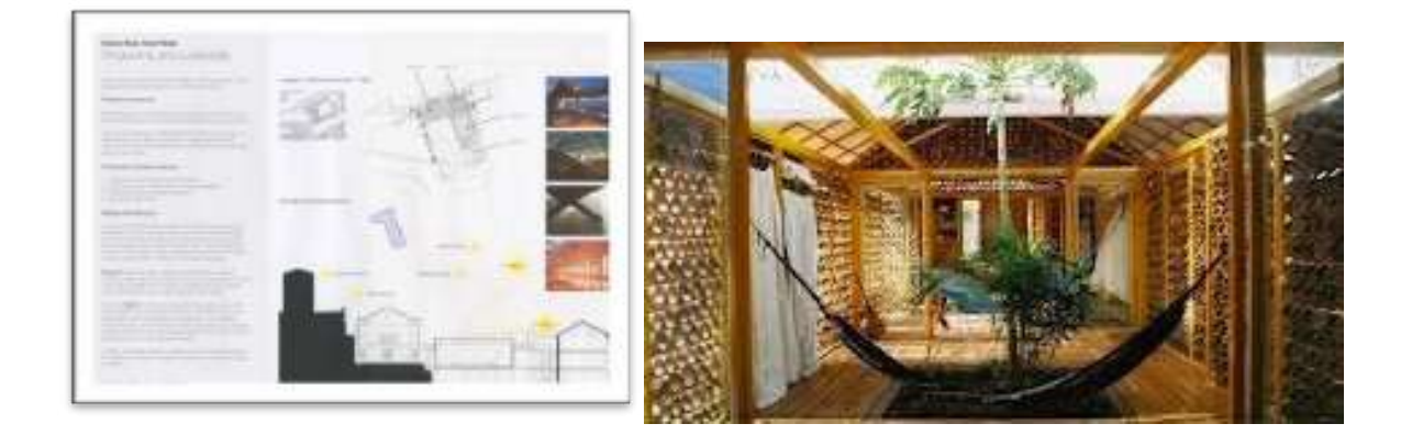
Fig. 1 Dance Base. Case Study (Edinburgh) Fig. 2 Tropical Dwelling Case Study (Indonesia)

Examples here are given of Satish BK's tutored case study work, in this case an environmental analysis of the Richard Murphy's Dance Base Studios in Edinburgh, by, this is contrasted with Ola Uduku's tutored Tropical Dwelling Case Study, in Indonesia.