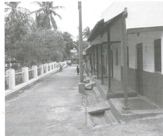
Figure2: View of external space of a typical Agrahara

Shared facilities (including party walls), the efficient use of semi-open outdoor spaces for much of the day, and the effective use of multi-purpose areas all facilitated a compact building footprint. Using locally available material within a climatically responsive layout and construction would today be regarded as a good example of efficient sustainable development. Plot ratios are dense compared to more diffuse contemporary layouts with less environmental impact because of a more efficient land use. Comparisons in Mysore of typical Agrahara settlements with contemporary middle income settlements indicate an increased dwelling footprint. Cartographic measurements of representative land parcels indicate that for a contemporary dwelling, 50% more plot area is required compared to more traditional Agrahara typologies.