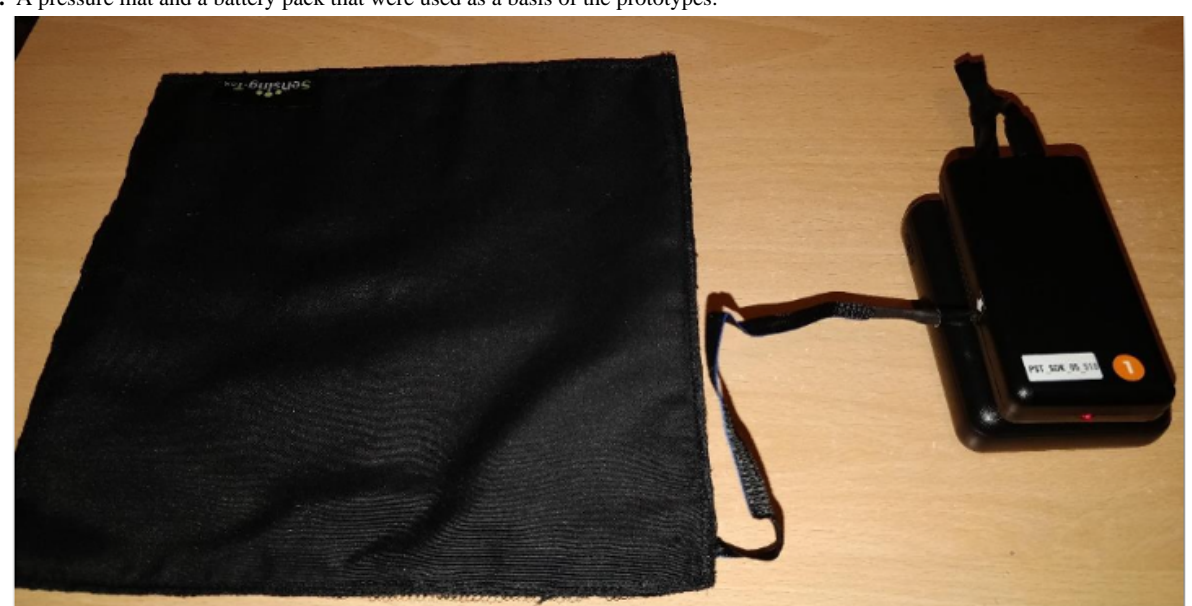
Figure 2. A pressure mat and a battery pack that were used as a basis of the prototypes.

A flow diagram showing how the prototypes worked is available in Multimedia Appendix 2.