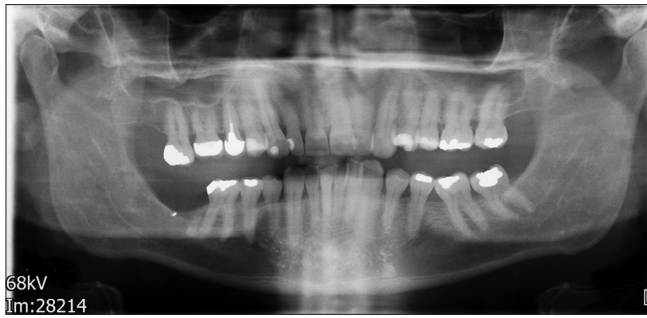
Figure 2: Panoramic radiograph. No obvious odontogenic or bony pathology is noted