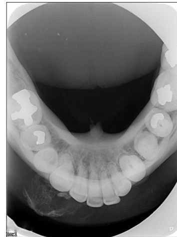
Figure 1: The mixed radiopacity lesion rising from the buccal aspect of the right parasymphiseal region is evident on this mandibular true occlusal radiograph, with an ill-defined periphery

The mandibular true occlusal radiograph [Figure 1] demonstrates a calcified, slightly multilocular appearing lesion arising from the buccal cortex of the mandible in the right parasymphiseal region. The occlusal radiograph demonstrates the area as prominent with a mildly irregular periphery and lies adjacent to the lower right lateral incisor to first premolar. Although this lesion was not readily apparent on the panoramic radiograph, it did serve to help steer the differential diagnoses away from odontological causes [Figure 2]. Although features were not entirely